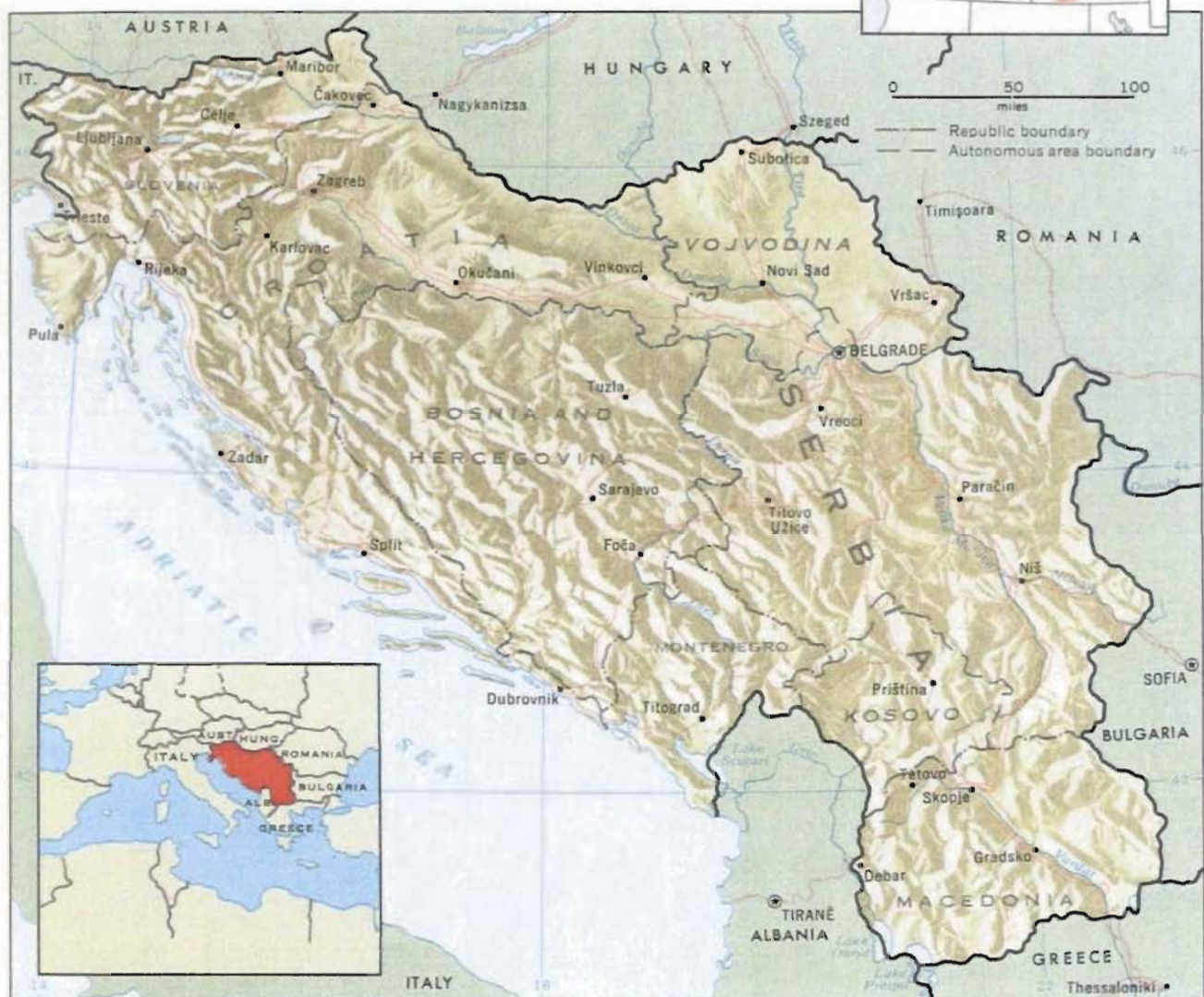
MAP 1 THE FORMER YUGOSLAVIA, 1945-91