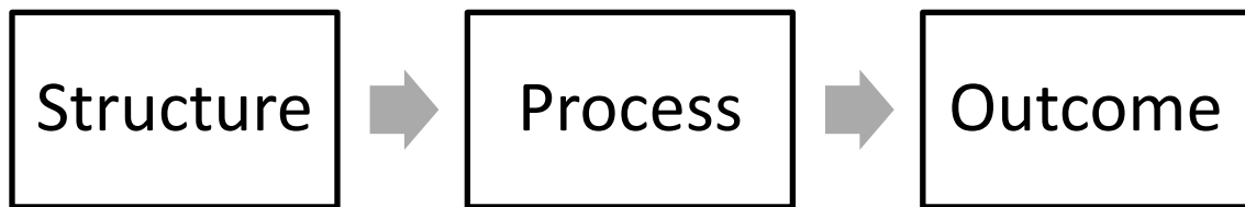
Figure 2. Quality of care assessment model (Donabedian, 1980).

health care quality in terms of outcomes, measured as the expected improvements in the health status attributable to care. The health services research and the quality improvement communities have used the structure, process, outcome model widely (Romano & Mutter, 2004) and it is the best known model for measuring quality of care. Donabedian (1980) suggested that quality of care measurement should include structure, process, and outcome variables. Figure 2 represents the relationships among these elements.