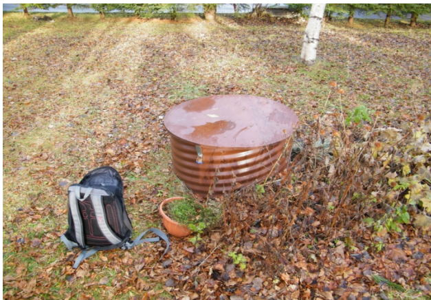
Figure 5: Only dug well in our study showing negative coliform in both summer and fall

The drill well shown in Figure 4 had a secured well head and the surrounding area was a properly maintained, flat surface. The well was located at least 100ft from the house, but close to the shed (seen in the figure). Water was regularly (once a year) monitored by the well owner. However, physical and chemical analysis showed little elevated level of turbidity (1.8 NTU) and manganese (0.31 mg/l).