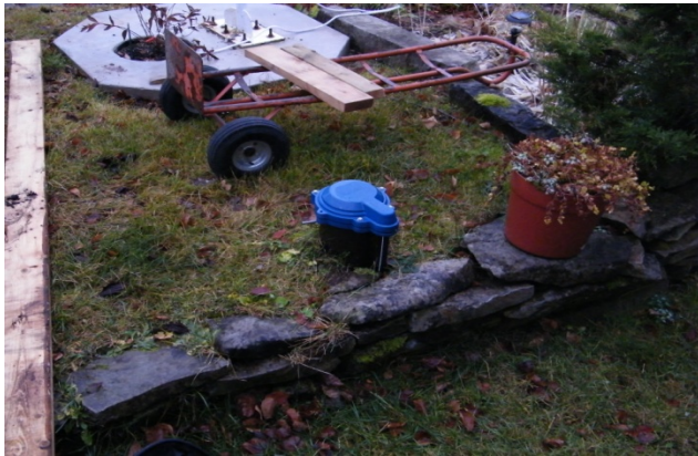
Figure 2: This drill well became contaminated by total coliform in fall

Figure 1 shows two wells, which were contaminated by total coliform in summer and fall. Well 'a' also had fecal coliform in fall. Physical and chemical parameters of well 'a' were within normal limit. Water samples of both sources were visibly clear and transparent and owners were happy with its taste, odor and color. Well 'a' was close to a river bank and surrounding land sloped towards the river. Possibly the well remained contaminated by surface run off from surrounding highland. Well 'b' is close to wetland; however, the source of contamination could not be ascertained during our survey. Physical and chemical parameters of well 'b' showed high turbidity, iron and manganese.