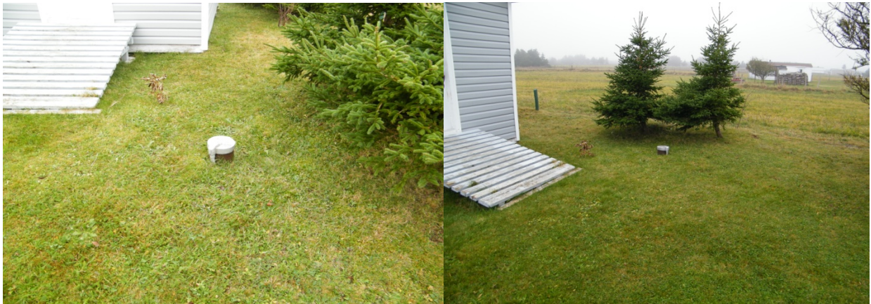
Figure 4: Drill well remained free from microbial contamination in summer and fall

The dug well shown in Figure 3 was highly contaminated as indicated by total coliform counts measured in the summer and had bacterial overgrowth in fall. The well was covered with Styrofoam and the color of the water was brownish. Water was used for cooking, bathing and washing. In the kitchen an aerator was used before using water in cooking. The well owner did not monitor the well regularly and the last proper cleaning with Javex TM (sodium hypochlorite) was done five years prior. A walk through survey identified a boggy marshy land nearby; however, this could not be ascertained as its link to poor quality water. Chemical analysis showed the highest color (135 TCU) and high turbidity (7.7 NTU) levels of all the wells sampled. This provides supporting evidence of surface contamination and hence high microbial level. The water also contained high iron and manganese.