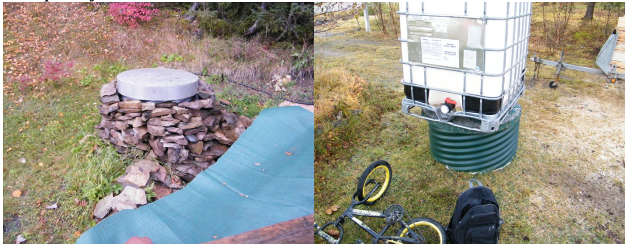
a) b) Figure 1: These two dug wells had total coliform contamination in both seasons and in addition well 'a' had fecal coliform