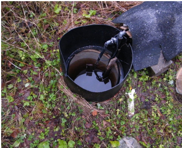
Figure 3: Dug well – summer sample was highly contaminated by total coliform (80) and fall sample had bacterial overgrowth.

The well shown in Figure 2 was free from any form coliform contamination in summer, but in fall it became contaminated (total coliform). Its physical and chemical parameters were within normal limit. Apparently the well head looked secured and properly maintained; however the contamination of the fall sample indicated possible underground seepage from the surrounding land. The slope of the surrounding ground was towards the well. The owner did not monitor the well regularly.