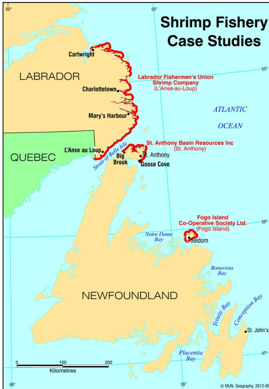
Figure 1: Shrimp fishery case studies