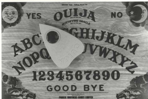
Figure 4.2 A small version of the Parker Brothers's Ouija board measuring 44.5cm x 29.5cm (17.5" x 11.5"). This board also has a heart-shaped pointer that glides over the board on three small legs. The letters are made visible through a small, round window.