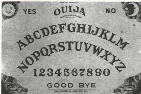
Figure 4.1 A large version of Parker Brothers' Ouija board measuring 55cm x 37.5cm (22" x 15"). This Ouija board, as well as the one in figure 4.2 was borrowed from Dr. Barbara Rieti. She purchased them at a flea market.