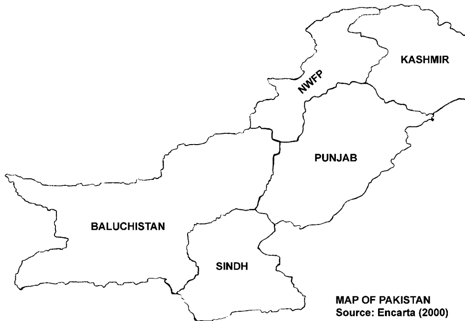
Figure 1. Map of Pakistan. doi:10.1371/journal.pone.0000209.g001

factors. In their review, they found the mean overall prevalence of depressive disorders and anxiety was 34% (range 29–66% for women and 10–33% for men). Factors associated with anxiety and depressive disorders were female sex, middle age, low level of education, financial difficulty, being a housewife and relationship problems. In a community based psychiatric clinic among all the patients who were seeking psychiatric help, 47% were found to be suffering from depression [14]. This study was conducted retrospectively on N = 700 patients who attended the psychiatric clinic during 1995–1997. The criterion for diagnosing depression was based on ICD-10. Based on other comprehensive local clinic based studies in all provinces of Pakistan, the findings regarding prevalence of depression were: Sindh: 16% urban, 12% rural, Punjab: 8% urban, 9% rural, Baluchistan: 40% urban, 2.5% rural, NWFP: 5% urban, 3% rural [15]. In a community-based study [16] conducted on an island of Karachi among adult women belonging to fisherman community, the point prevalence of depression was 7.5%. The criterion for diagnosing depression in this study was based on using Mini International Neuropsychiatric Interview, which was supplemented by ICD-10. In another study