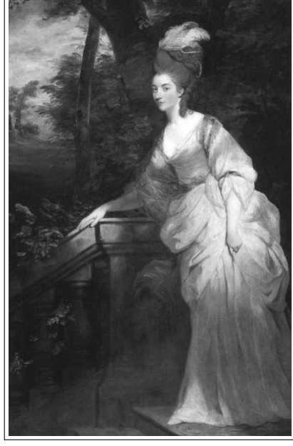
Georgiana, Duchess of Devonshire

[Chemistry] requires such an appropriation of time and property; such a variety of expensive and delicate instruments; such an acquisition of manual dexterity; and so much thought and attention to its successful prosecution, as will necessar-