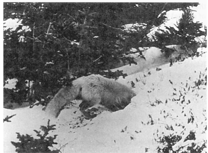
FIG. 1. Utilization of hoarded food in winter by red foxes. Upper) tracks in snow lead to and from a utilized cache; Lower) recovering cached food in winter (Photographs by B.O. Sklepkovych).