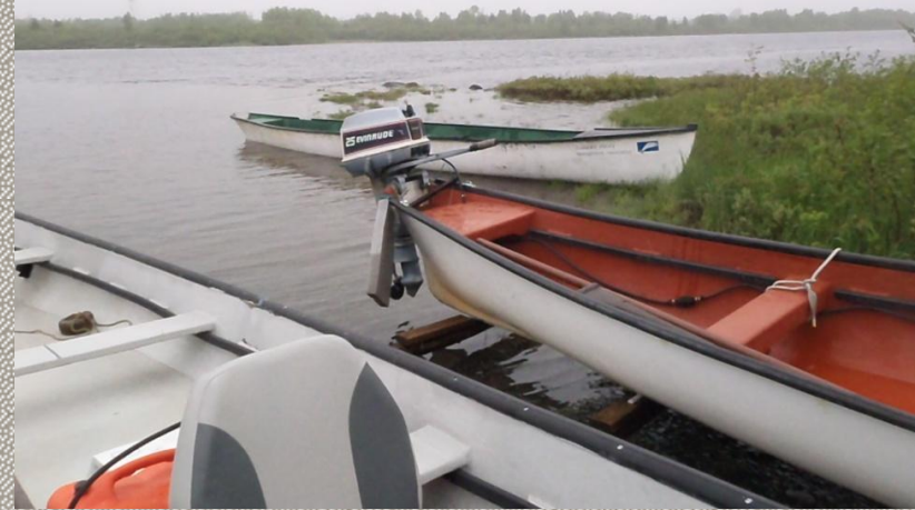
Gander River Boats, Appleton