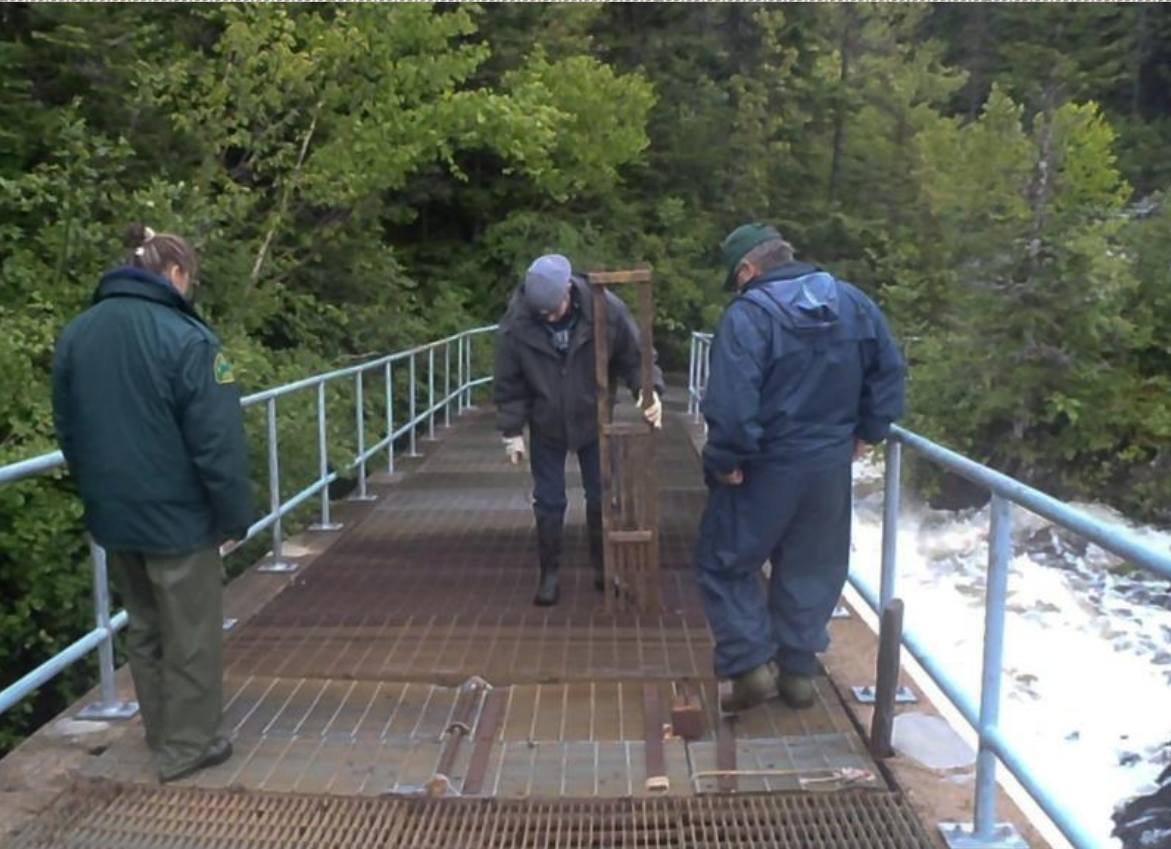
Counting fish, Salmon Brook Falls