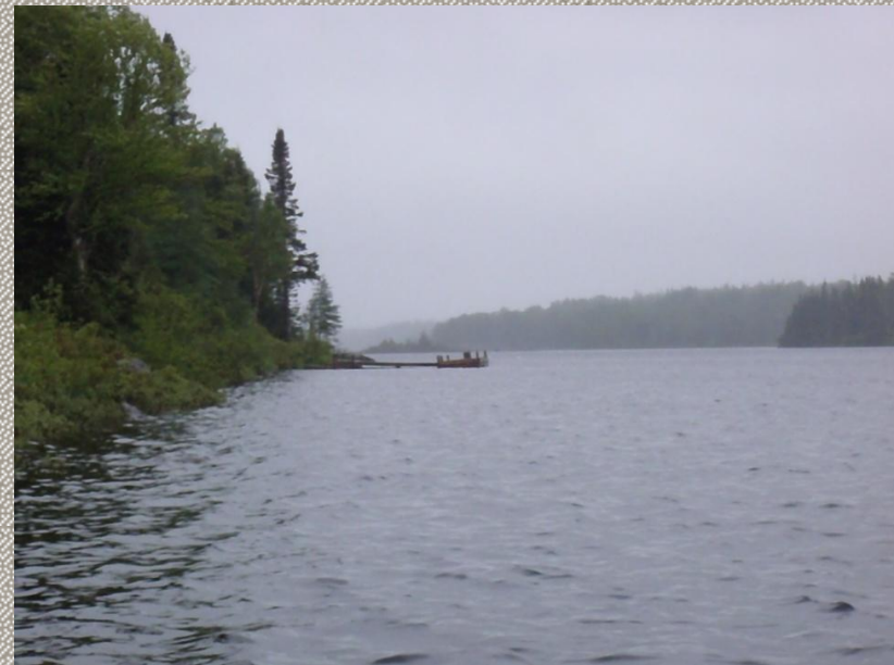
Forth Pond, Main Stem