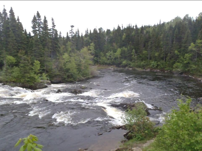
Salmon Brook Falls