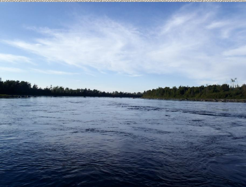
The Works, near river mouth