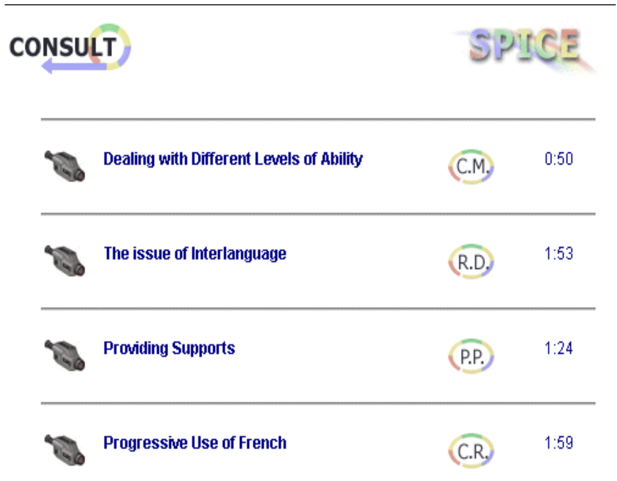
Figure 2. SPICE video menu.

how the problem manifested itself in his or her own context and to describe some of the ways in which he or she responded to the problem. The interviews were subsequently edited by the researcher/designer into 60 segments and given a title to summarize the content. All segments were then displayed in a menu with title, interviewees' initials and length of the segment as follows: