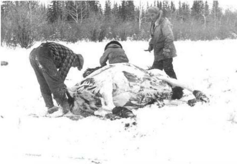
Hunters skin a bison as part of the 1948 slaughter, Wood Buffalo National Park.

By the late 1940s the dire consequences zoologists had predicted had mostly come to pass. The plains bison had bred freely with the wood bison and infected them not only with tuberculosis but also brucellosis (a disease causing intense fevers and miscarriages among pregnant females). Federal wildlife officials attempted to manage their way out of past mistakes, conducting annual round-ups and testing of bison so as to slaughter diseased animals. To provide revenue for the program, the government sold salvageable bison meat to northern trading companies and, increasingly, to meat packers, hotels, and restaurants in southern Canada. Between 1951 and 1967, wildlife managers killed four thousand park bison and distributed nearly two million pounds of meat. Periodically, the goals of disease control and commercial development came into conflict, particularly when the federal government's northern administration began to actively promote bison meat as part of a much broader program of economic development in the region.