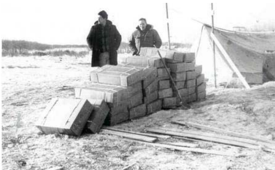
Bison meat ready for shipping from Hay Camp, Wood Buffalo National Park (1952)

By the late 1940s the dire consequences zoologists had predicted had mostly come to pass. The plains bison had bred freely with the wood bison and infected them not only with tuberculosis but also brucellosis (a disease causing intense fevers and miscarriages among pregnant females). Federal wildlife officials attempted to manage their way out of past mistakes, conducting annual round-ups and testing of bison so as to slaughter diseased animals. To provide revenue for the program, the government sold salvageable bison meat to northern trading companies and, increasingly, to meat packers, hotels, and restaurants in southern Canada. Between 1951 and 1967, wildlife managers killed four thousand park bison and distributed nearly two million pounds of meat. Periodically, the goals of disease control and commercial development came into conflict, particularly when the federal government's northern administration began to actively promote bison meat as part of a much broader program of economic development in the region.