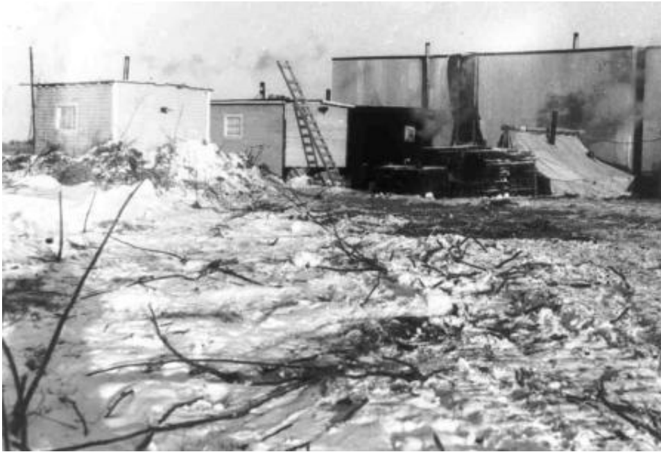
The Hay Camp abattoir (1952)

The Canadian government established the park in 1922 to protect a remnant herd of wood bison (a sub-species of the American plains bison), setting aside a large area of boreal forest plain that straddles the border between the province of Alberta and the Northwest Territories. Preserving the bison did not necessarily mean “hands-off” management, however, as government officials soon hatched a scheme to transport thousands of plains bison from the fenced and overstocked Buffalo National Park (a former park in southern Alberta) to the supposedly understocked range of Wood Buffalo National Park. Zoologists in Canada, the United States, and Britain vigorously and almost unanimously opposed the plan, fearing the loss of the wood bison sub-species to hybridization and the transmission of tuberculosis from the infected herds in southern Alberta. But government officials stubbornly persisted, transporting 6,673 plains bison to Wood Buffalo National Park between 1925 and 1928.