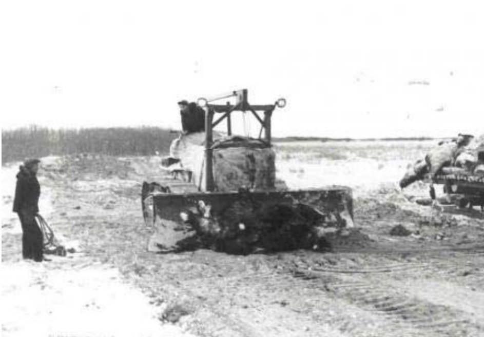
Bulldozing a slaughtered bison toward the Hay Camp abattoir, Wood Buffalo National Park (1952)

The Canadian government established the park in 1922 to protect a remnant herd of wood bison (a sub-species of the American plains bison), setting aside a large area of boreal forest plain that straddles the border between the province of Alberta and the Northwest Territories. Preserving the bison did not necessarily mean “hands-off” management, however, as government officials soon hatched a scheme to transport thousands of plains bison from the fenced and overstocked Buffalo National Park (a former park in southern Alberta) to the supposedly understocked range of Wood Buffalo National Park. Zoologists in Canada, the United States, and Britain vigorously and almost unanimously opposed the plan, fearing the loss of the wood bison sub-species to hybridization and the transmission of tuberculosis from the infected herds in southern Alberta. But government officials stubbornly persisted, transporting 6,673 plains bison to Wood Buffalo National Park between 1925 and 1928.