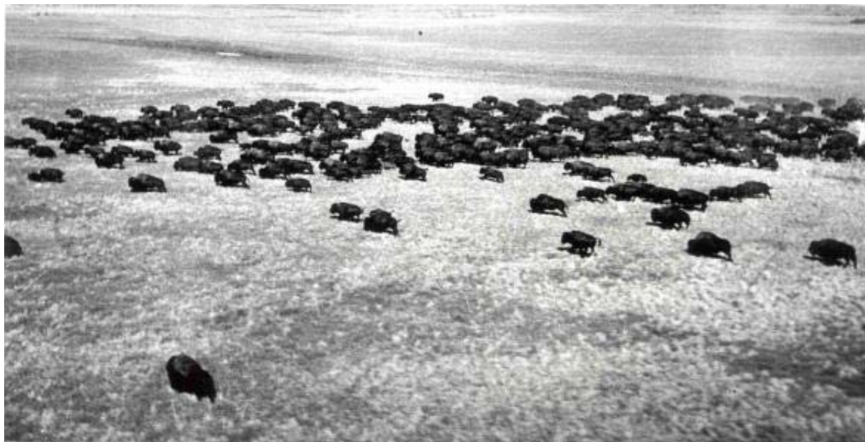
Bison population survey photograph, Wood Buffalo National Park (17 July 1946)

Wood Buffalo National Park claims many distinctions: it is North America's biggest national park (and the world's second biggest at 44,807 km 2 ), a UNESCO World Heritage site, home to the largest free-roaming herd of wood bison, the first federal park in Canada's territorial north, summer home to the last major migratory flock of whooping cranes, and the largest dark-sky reserve on the planet. These accolades may lend themselves to a popular image of remote wilderness, but the park's wildlife has also been subject to some of the most intrusive and ill-conceived management interventions in Canadian history.