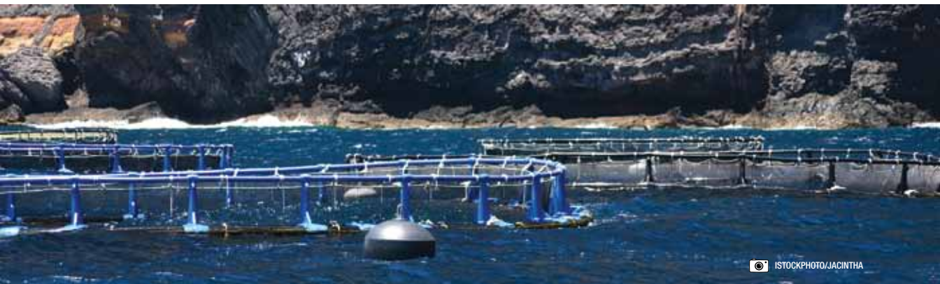
A traditional cage fish farm in the Atlantic Ocean near Tenerife, Spain.

Currently, seafood and aquaculture companies primarily dispose of waste through permits to dump at sea or by dumping in landfills. In addition to the environmental impacts of these actions, there are significant costs to the