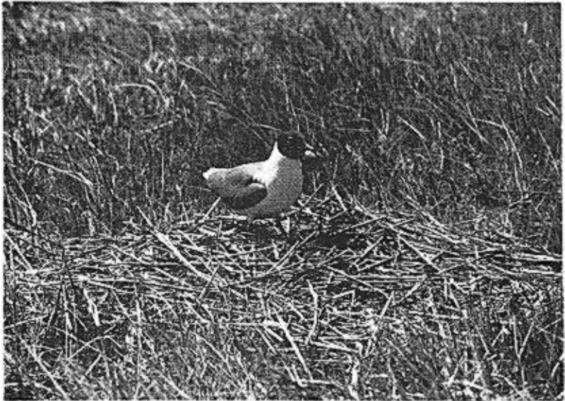
FIGURE 1. Laughing Gull holding an eggshell in its beak. The bird may simply drop the shell over the nest rim, walk with the shell from the nest, or fly off with the shell.

nest cup. Of the eggshells in the nest cup many belonged to newly hatched chicks and would probably have been removed eventually. One hundred forty-five (50%) of the shells were found out of the nest within 2 m of the nest rim; 87 (30%) of the shells were within 25 cm of the nest rim. About 9% (25 shells) were between 2 and 4 m from the rim, whereas 43% (127) were missing (not found within 4 m of the nest). Of the 102 eggshell removals observed from a hide, 51% (52) involved a gull flying with the shell away from the nest. Approximately 26% (26) of the shells were picked up by gulls that walked from the nest before dropping the shell; 24% (24) of the eggshells were picked up and simply dropped over the nest rim (Fig. 1). Observations on identifiable individuals and pairs revealed that some birds repeatedly flew off with eggshells, whereas others consistently walked with or dropped shells from the nest.