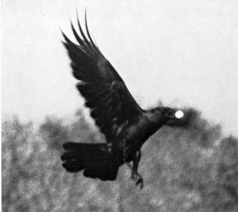
Fig. 2. Crows in flight with eggs: A) small (S) egg, B) medium (M) egg, and C) large (L) egg.