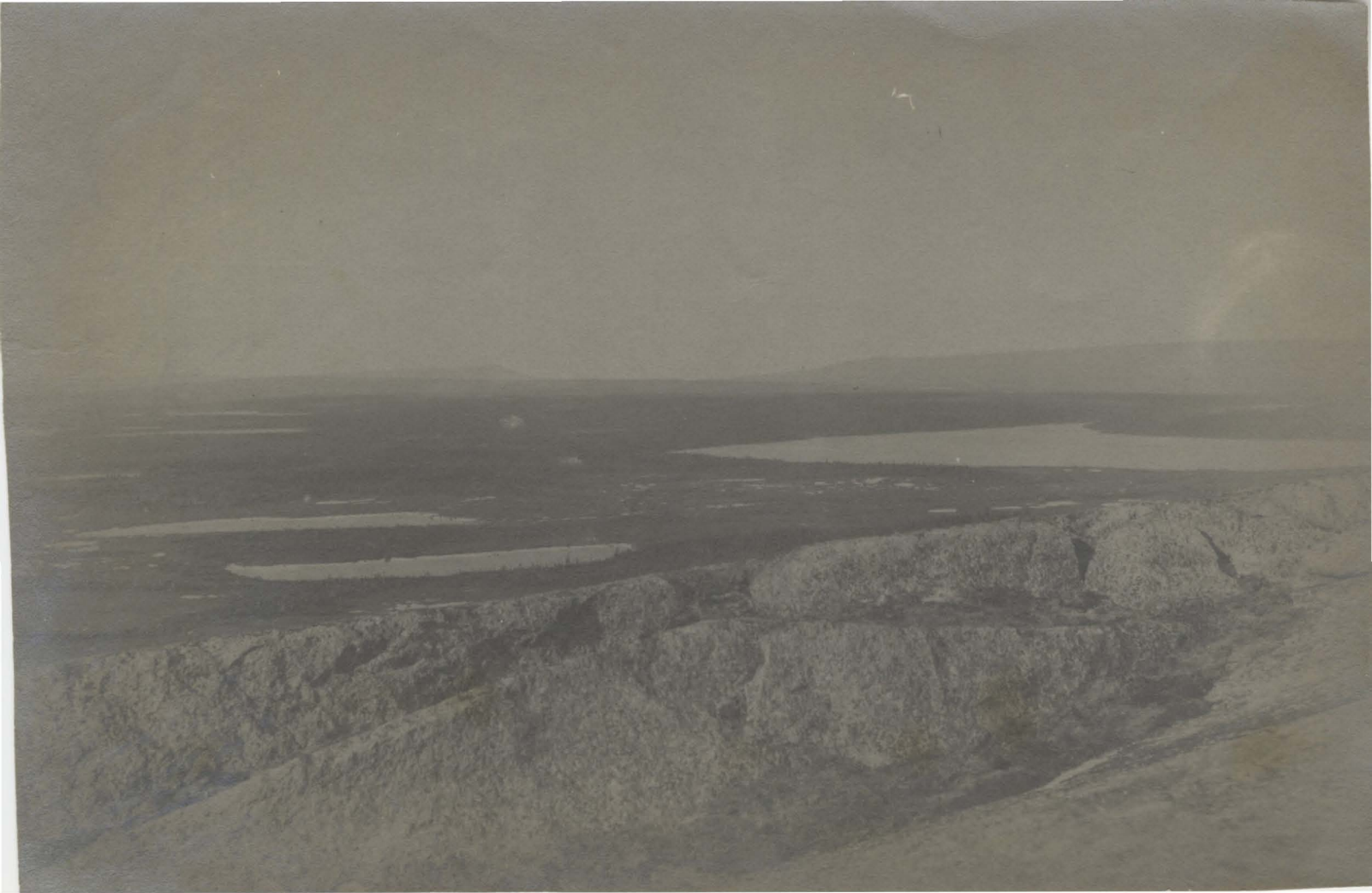
19. [1476] View from summit of Gaff Topsail