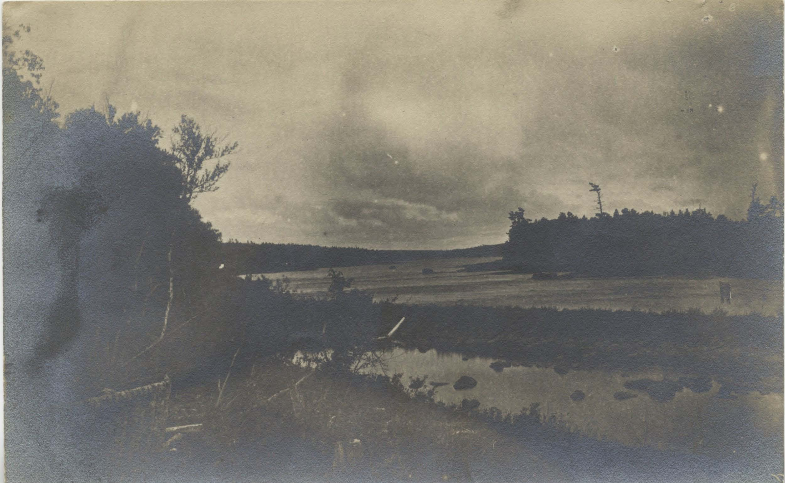
26. Junction of Badger and Exploits Rivers