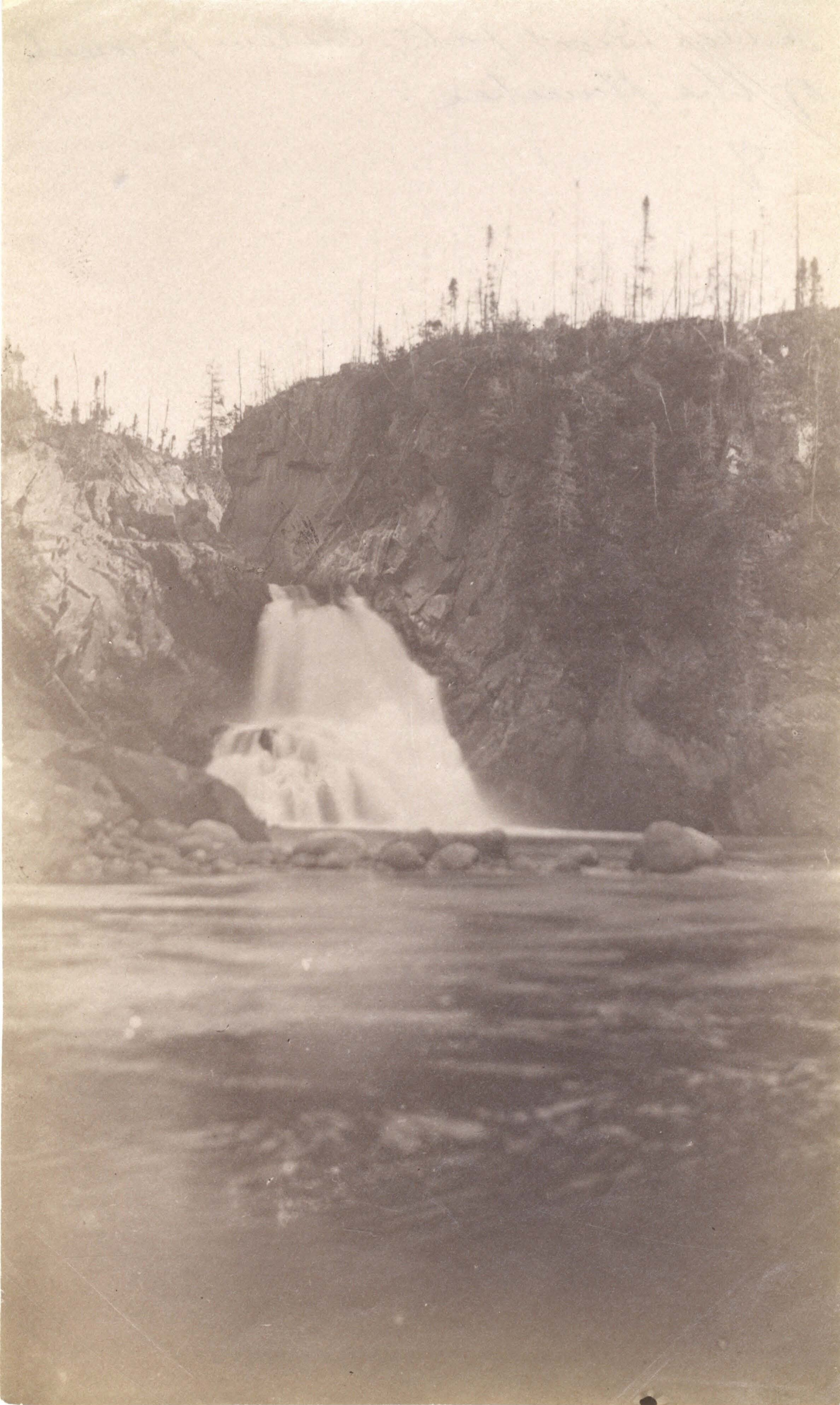
8. Kitty's Brook fall. Eastern Branch of the Humber