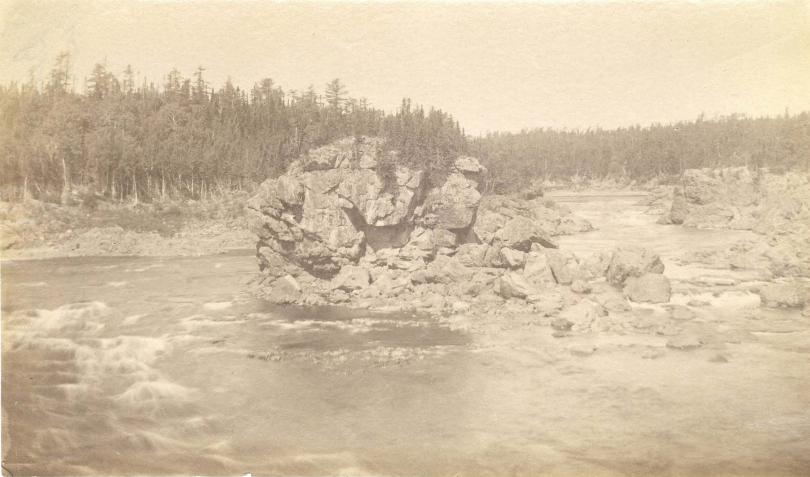
5. [1095] Buchan's rock, lower end Grand Falls cannon [canyon] Exploits River