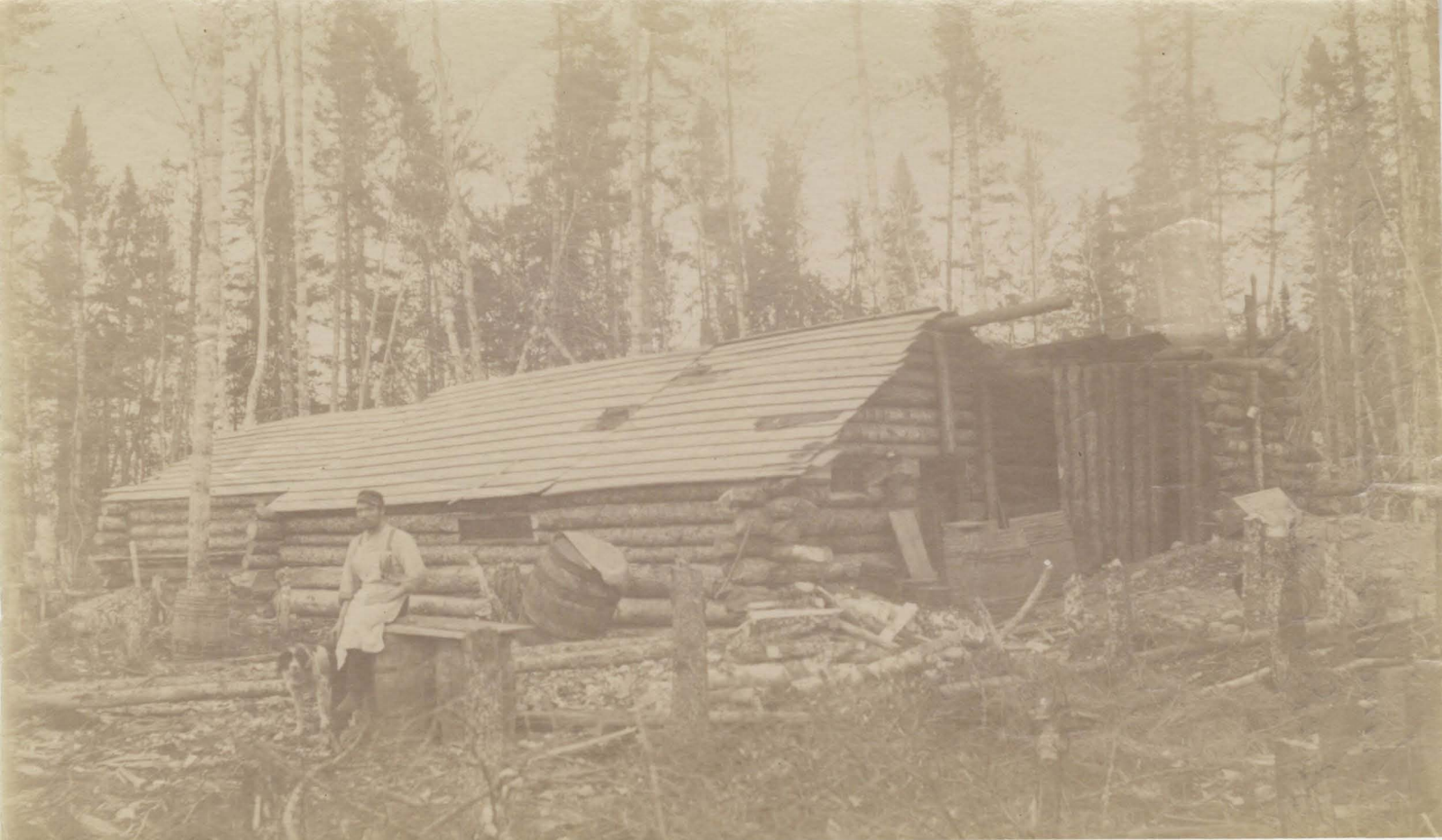
25. Lumbermens Camp at Badger Brook Exploits River