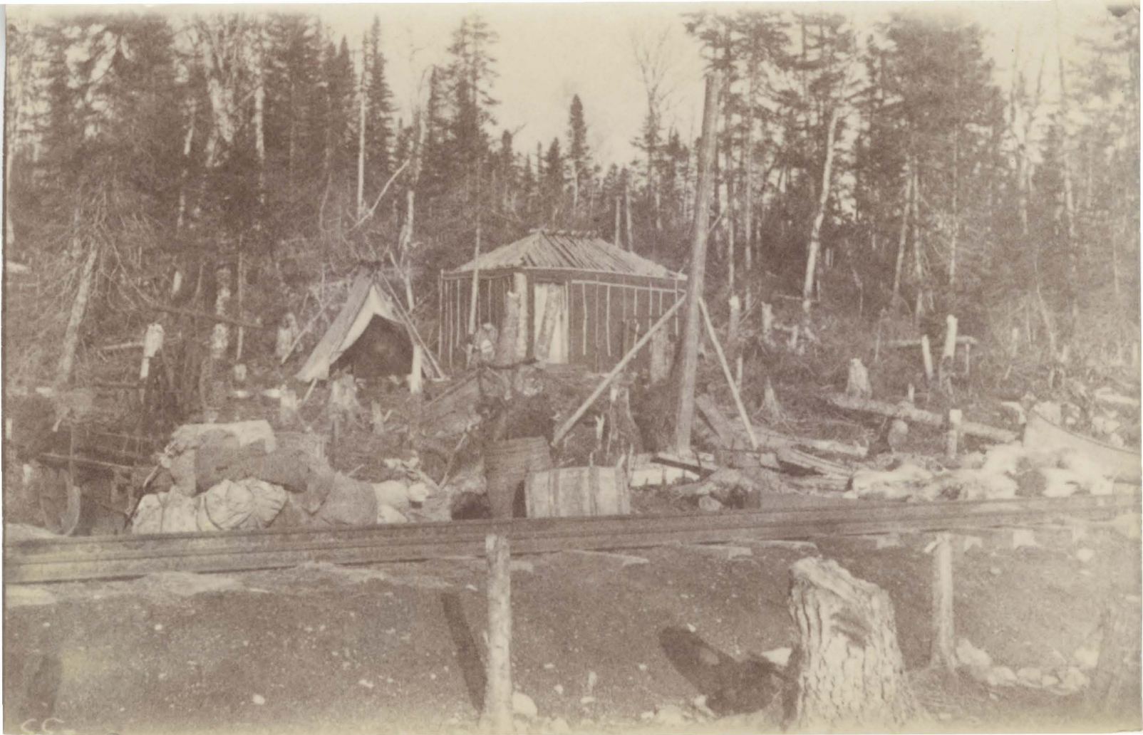
21. [1484] Shack near Millerton Junction, near Joe Glodes Pond