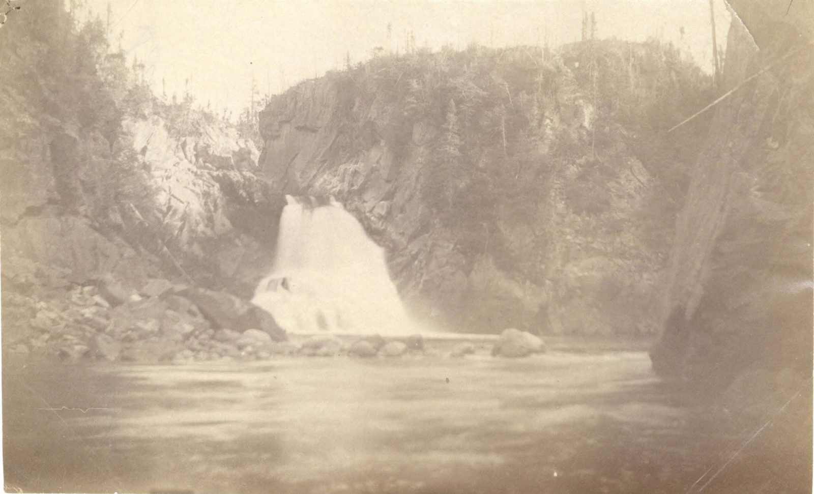
9. Fall on Kitty's Brook near Sandy Lake