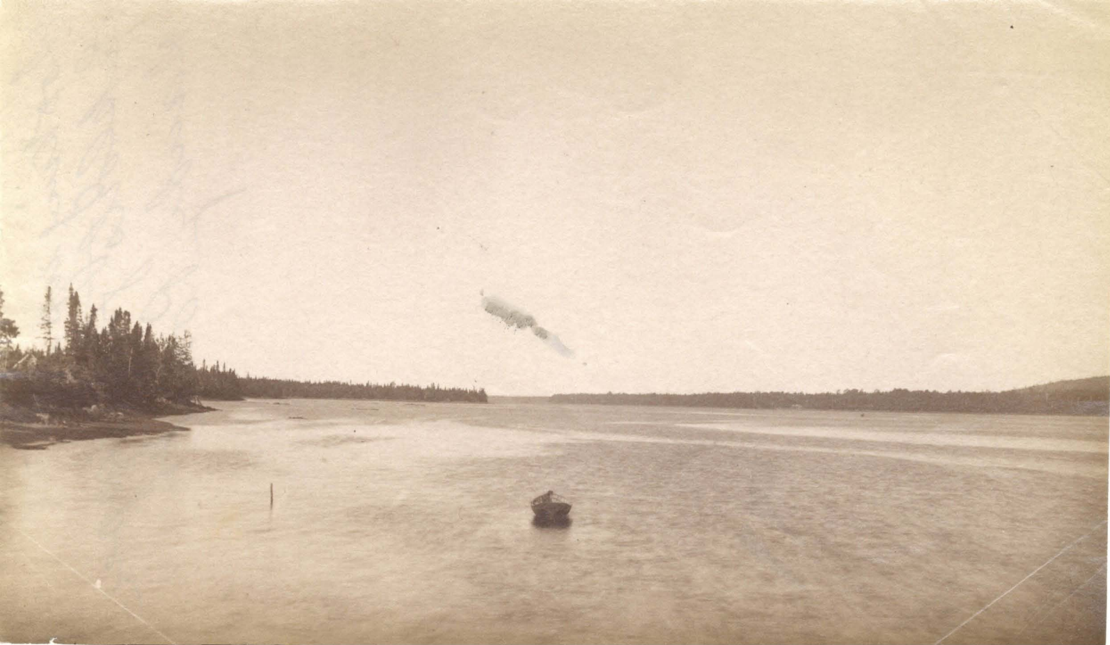
3. [1094] Looking up the Exploits from Upper Sandy Point