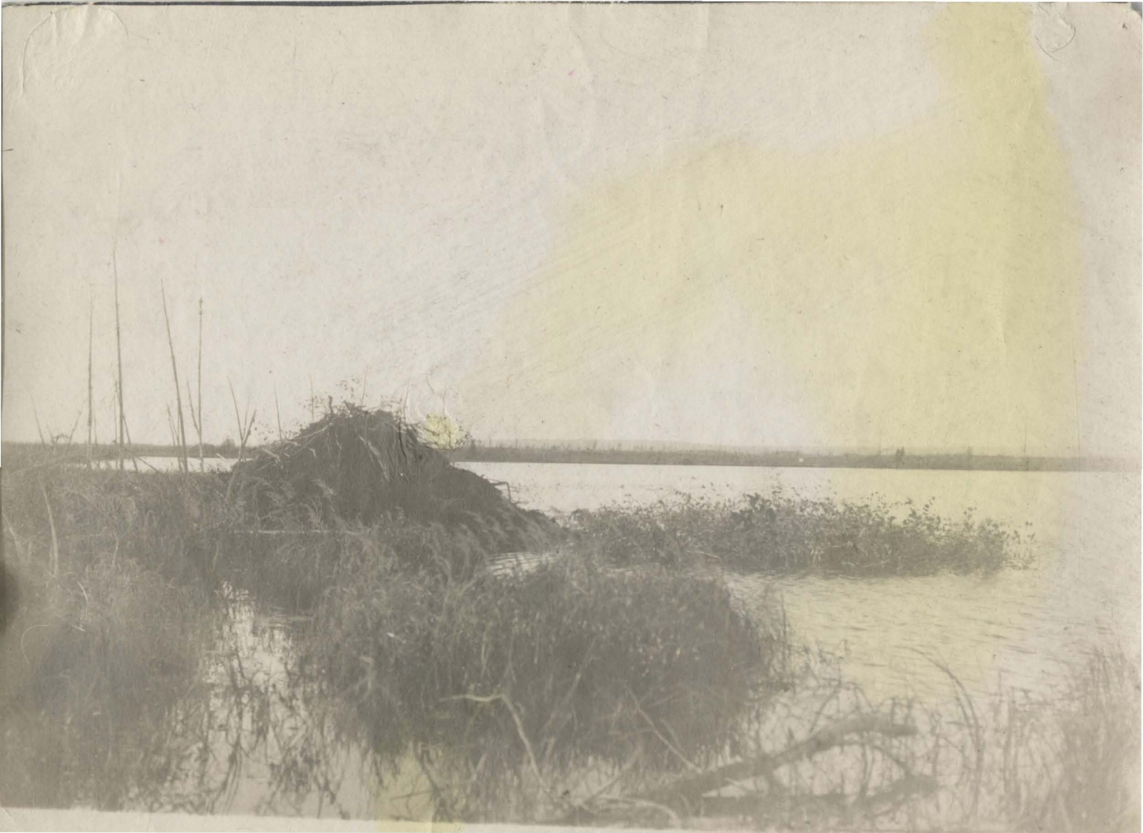
39. Beaver house near MacGregor