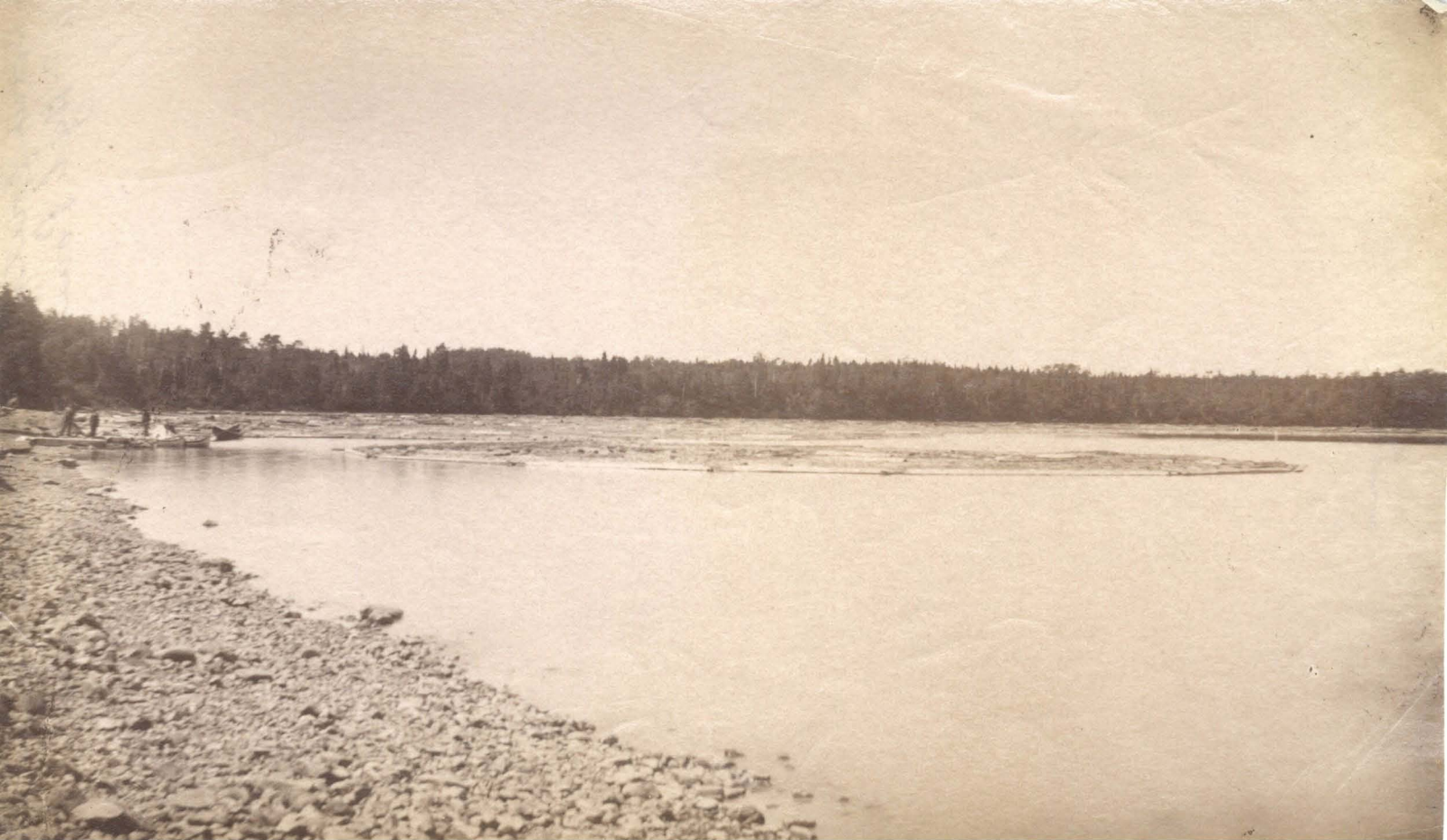
4. [1094] Boom containing 28,000 pine logs. at High Point Exploits River