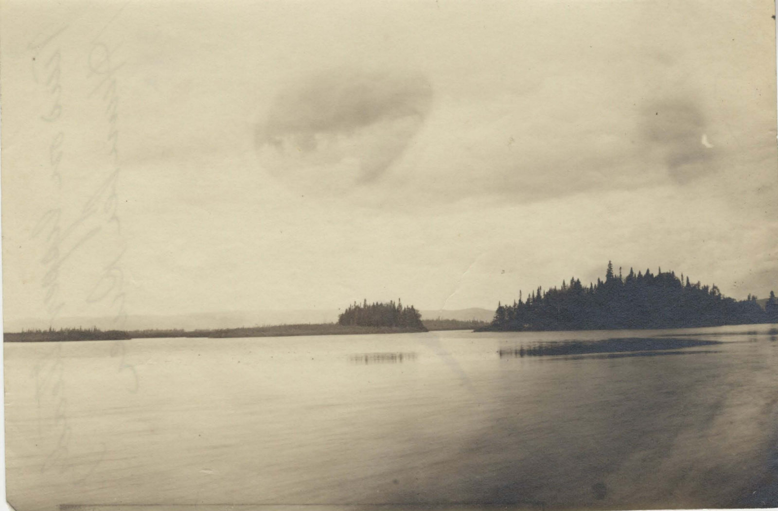
34. View on Upper Steady Humber River