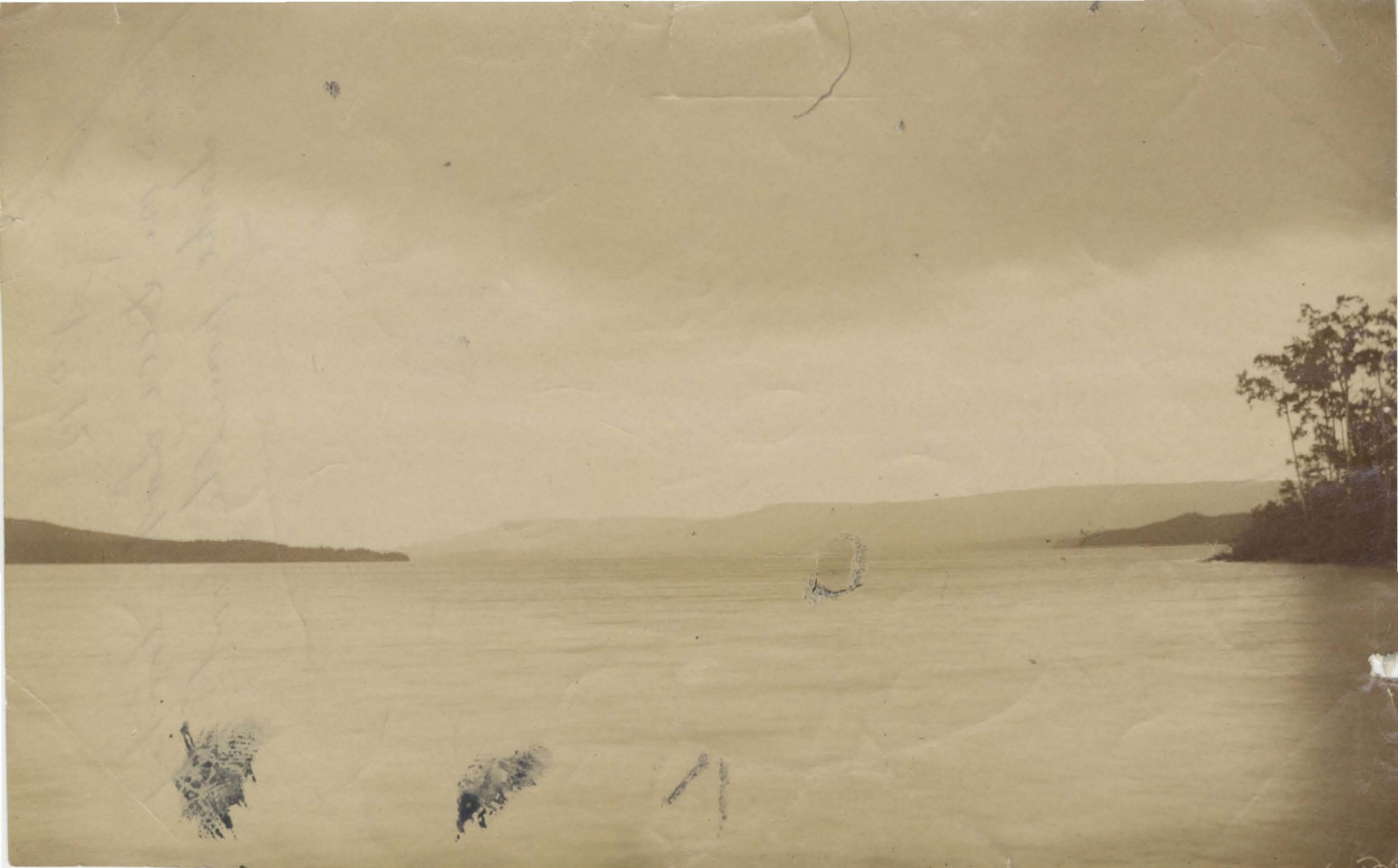
31. View on Deer Lake looking up Lake from the foot