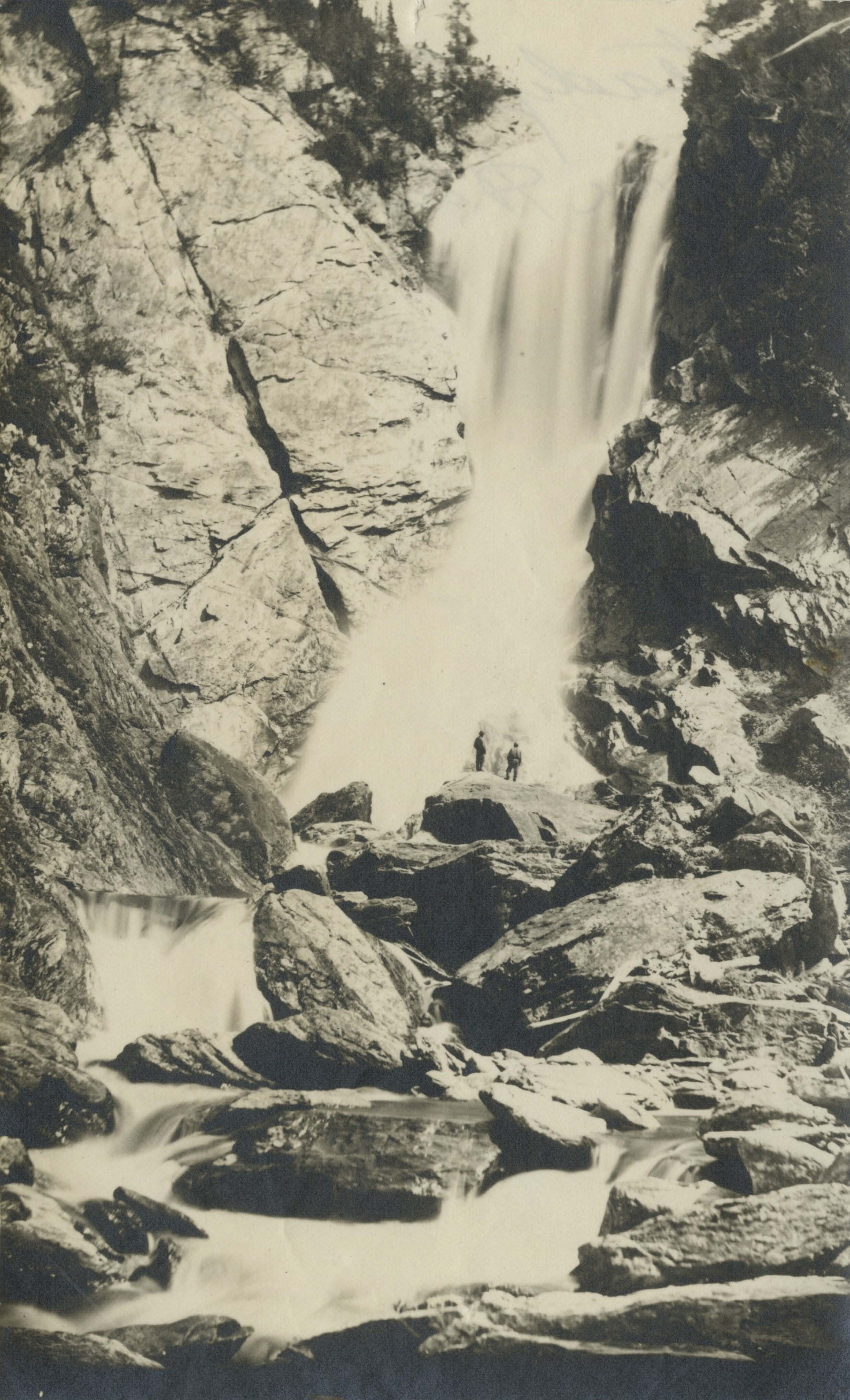
37. Steady Brook fall Lower Humber