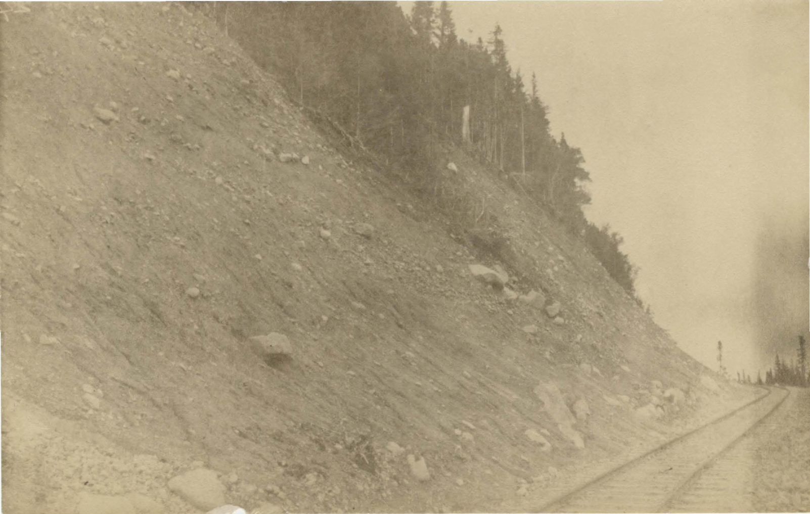
18. Railway cut near Gambo, Bonavista Bay