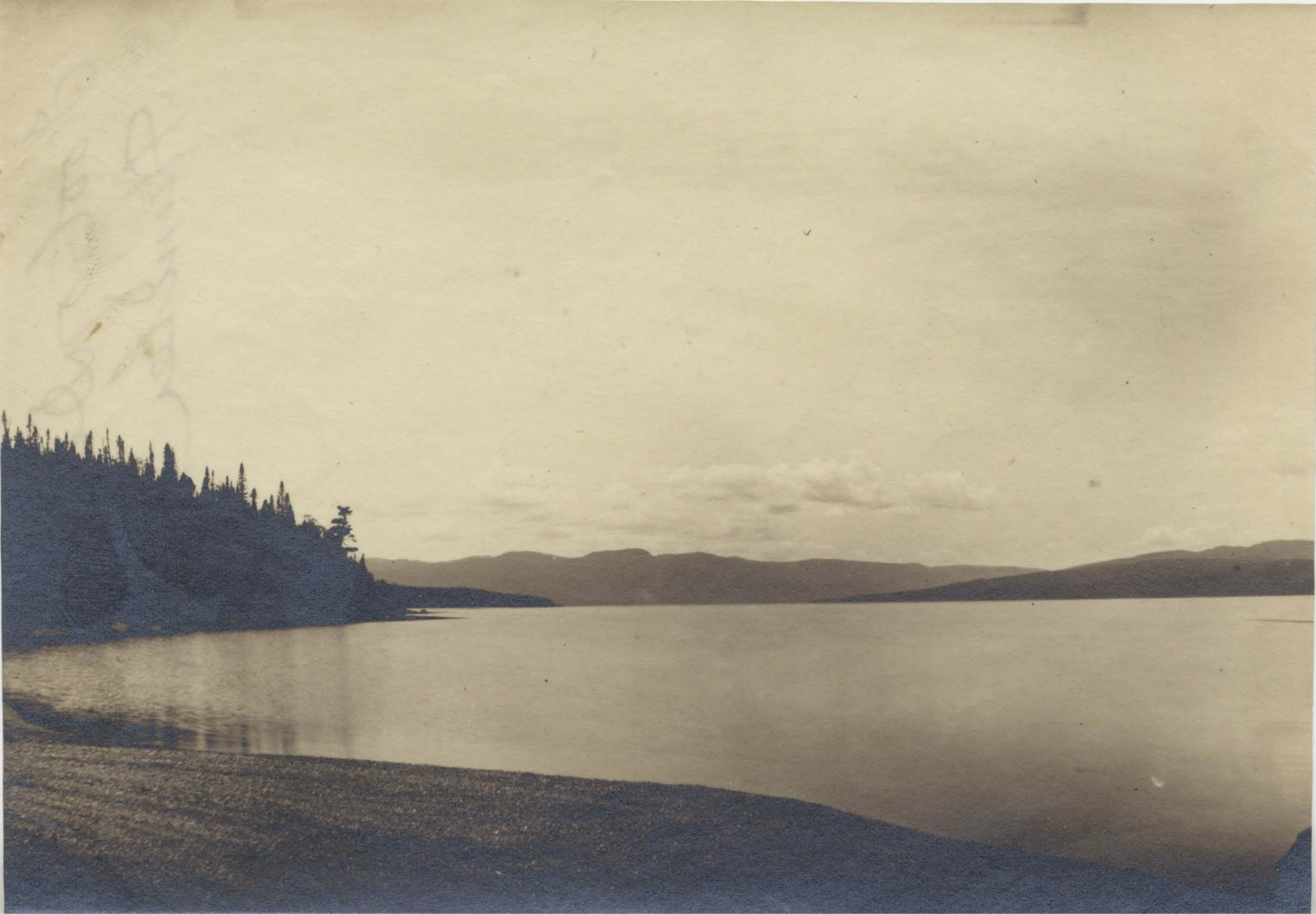
30. Foot of Deer Lake Humber River