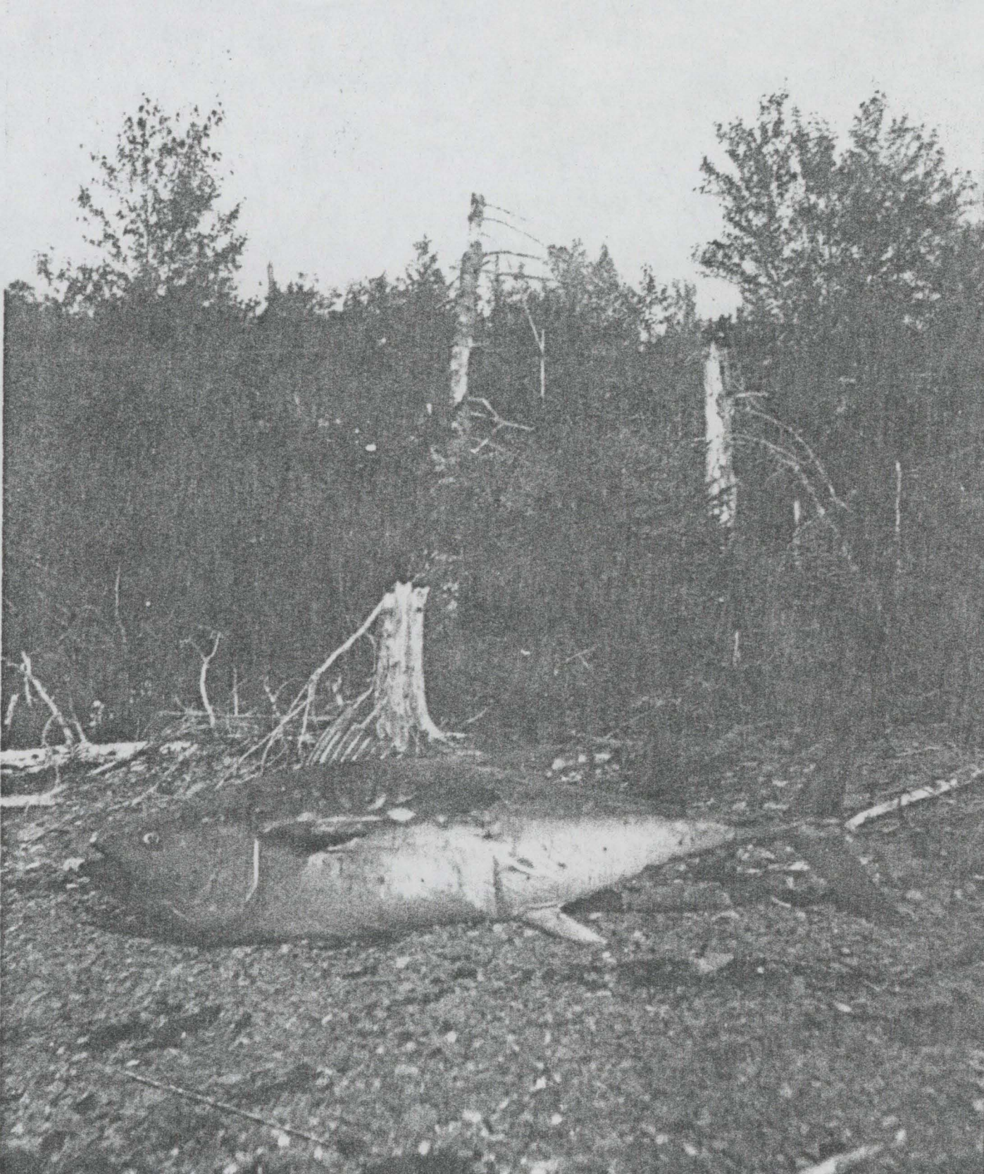
22. [1777] Horse Mackerel on the beach of Miller Island