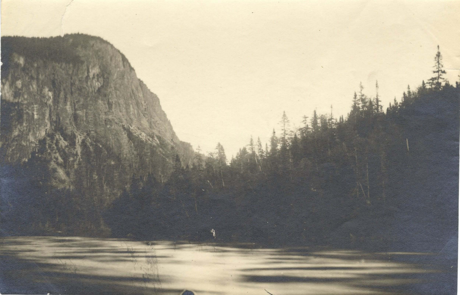
10. Marble Mountain Lower Humber