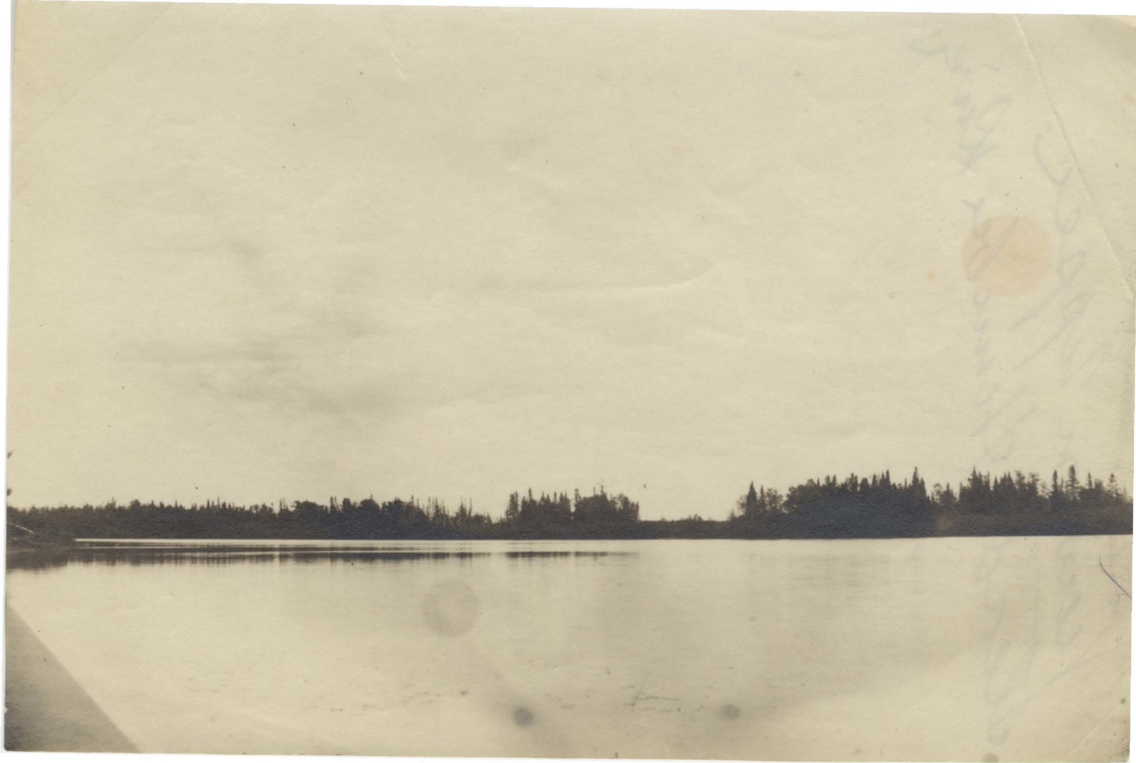
33. View on Upper Steady Humber River