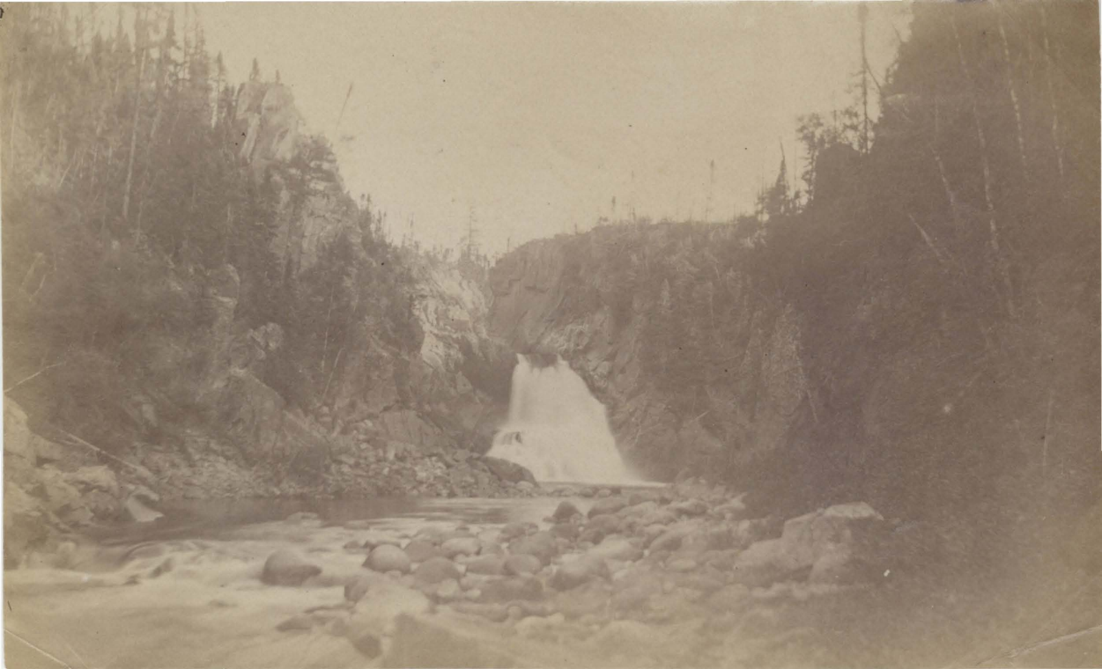
20. [1536] Kitty's fall Kittys Brook