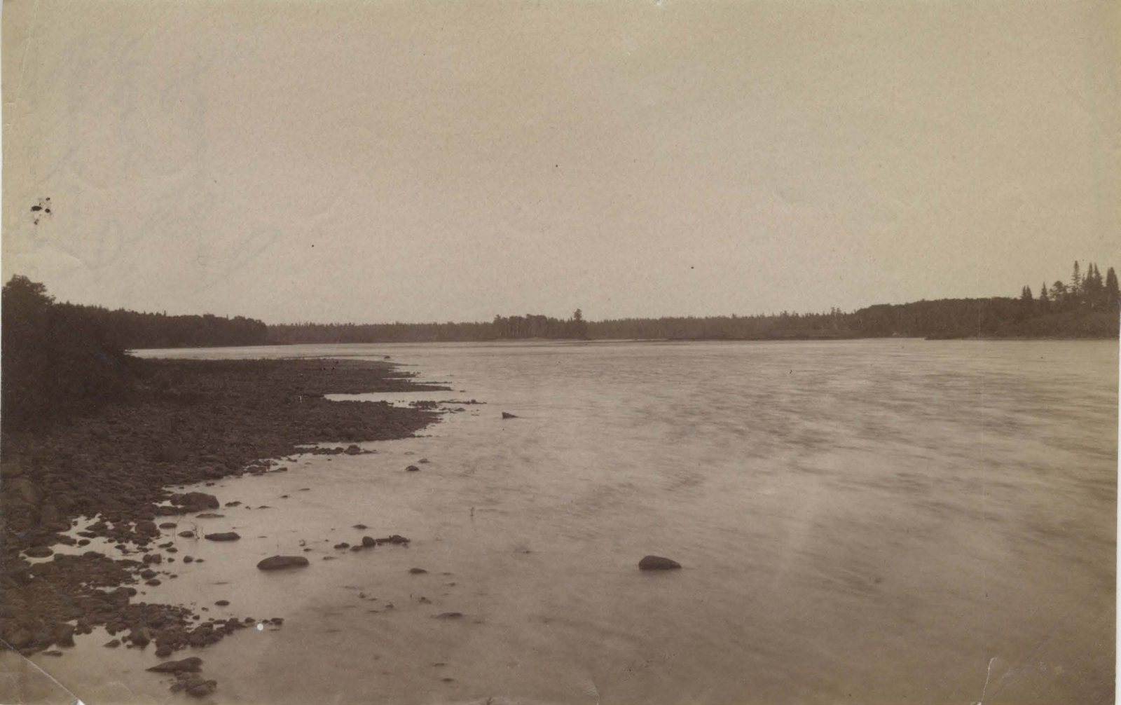
24. View on the Exploits River looking down near junction of Sandy Brook