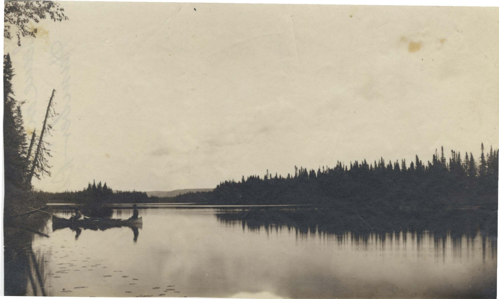
36. Scene on Upper Steady Humber River