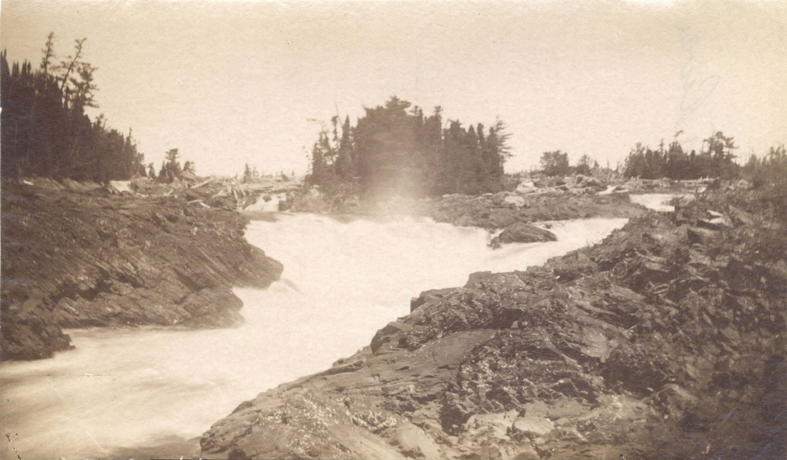
1. [1095] Grand Fall of the Exploits River in 1875