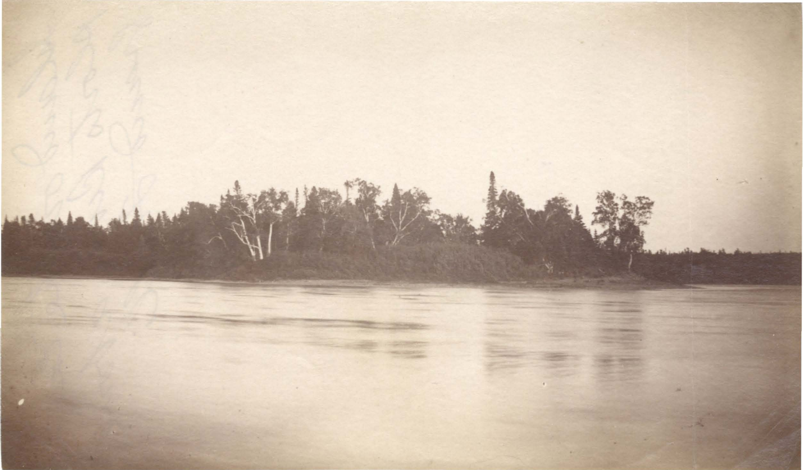
6. [1095] Island on the Exploits River above Grand Falls