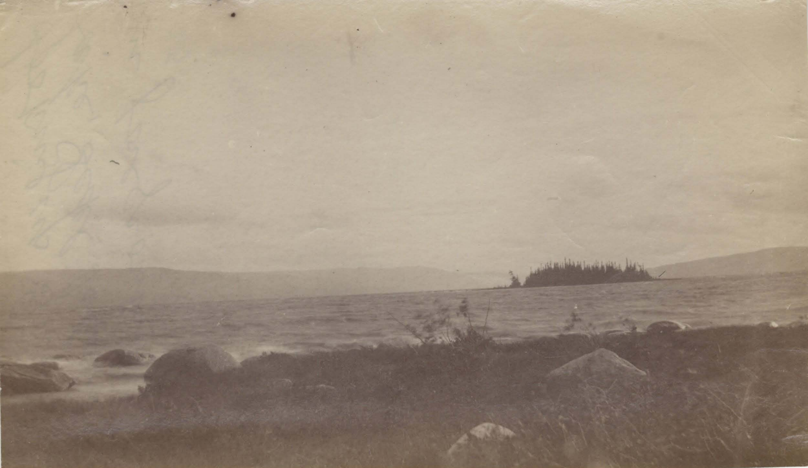
35. Looking up Grand Lake, Seal Island in foreground