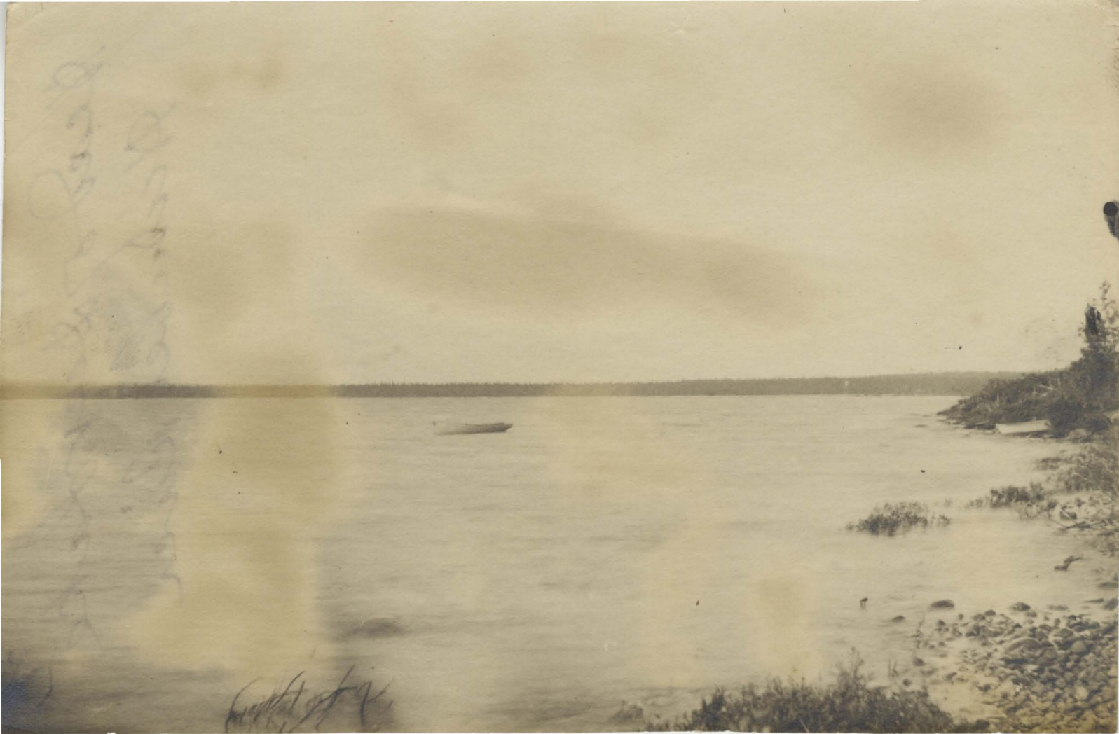
28. Head of Deer Lake Humber River