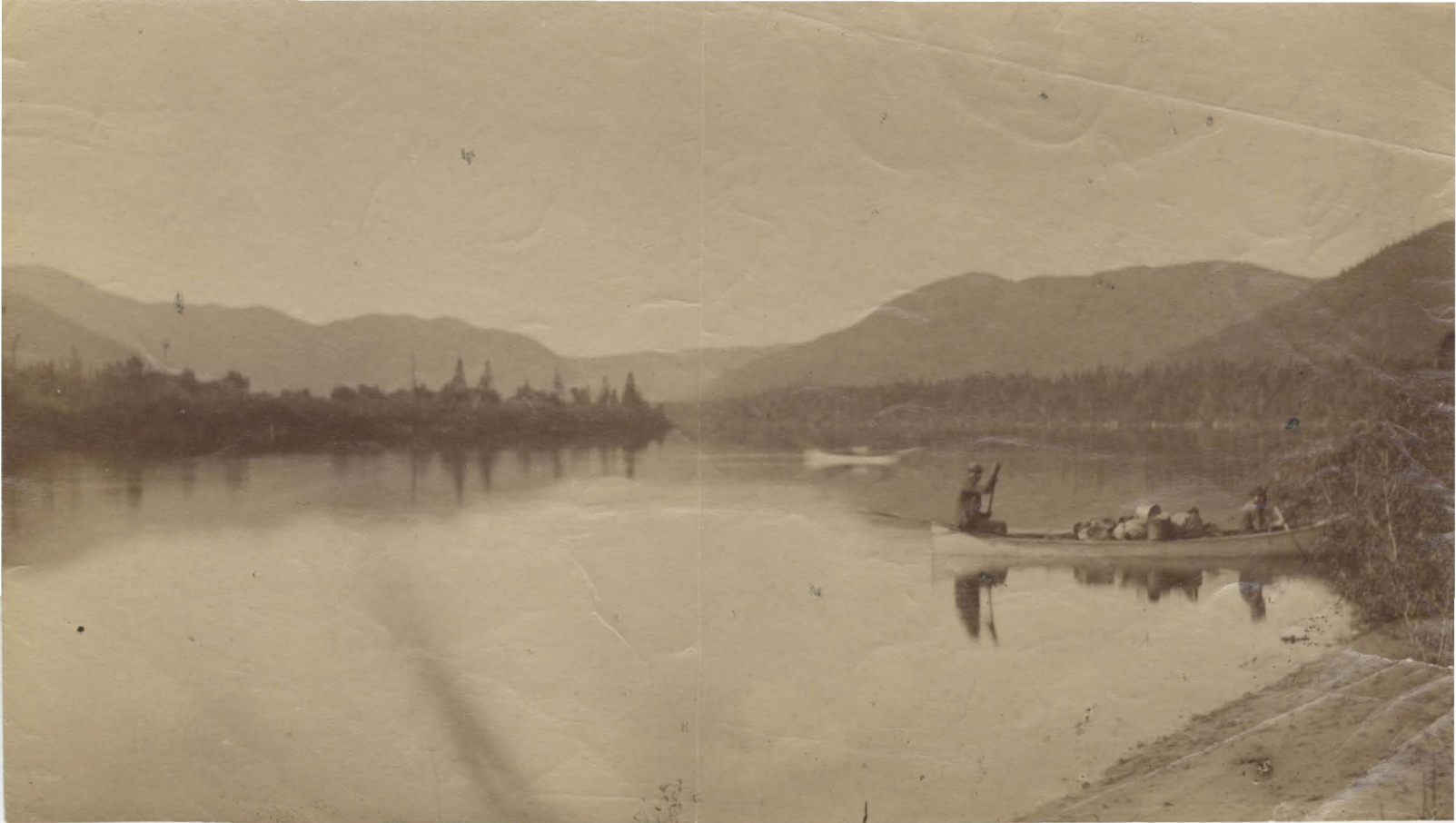
32. Looking down the lower Steady of the Humber River