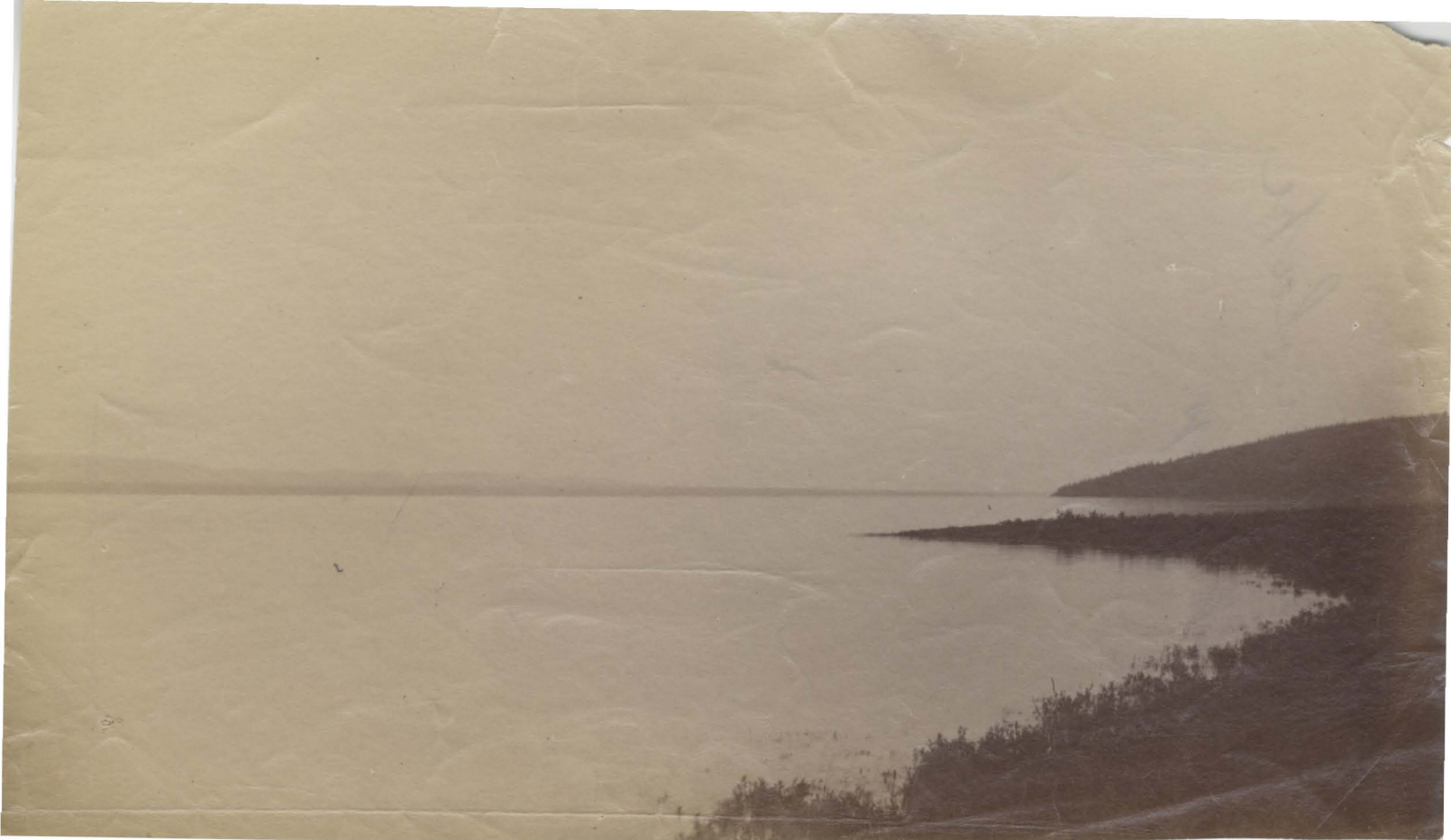
27. View on Deer Lake Looking up