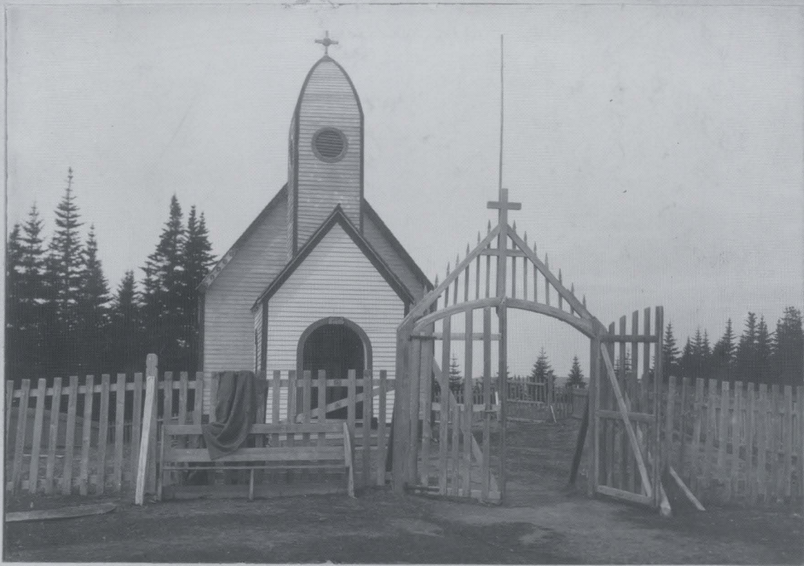
Chapel of the Micmacs, Conne River