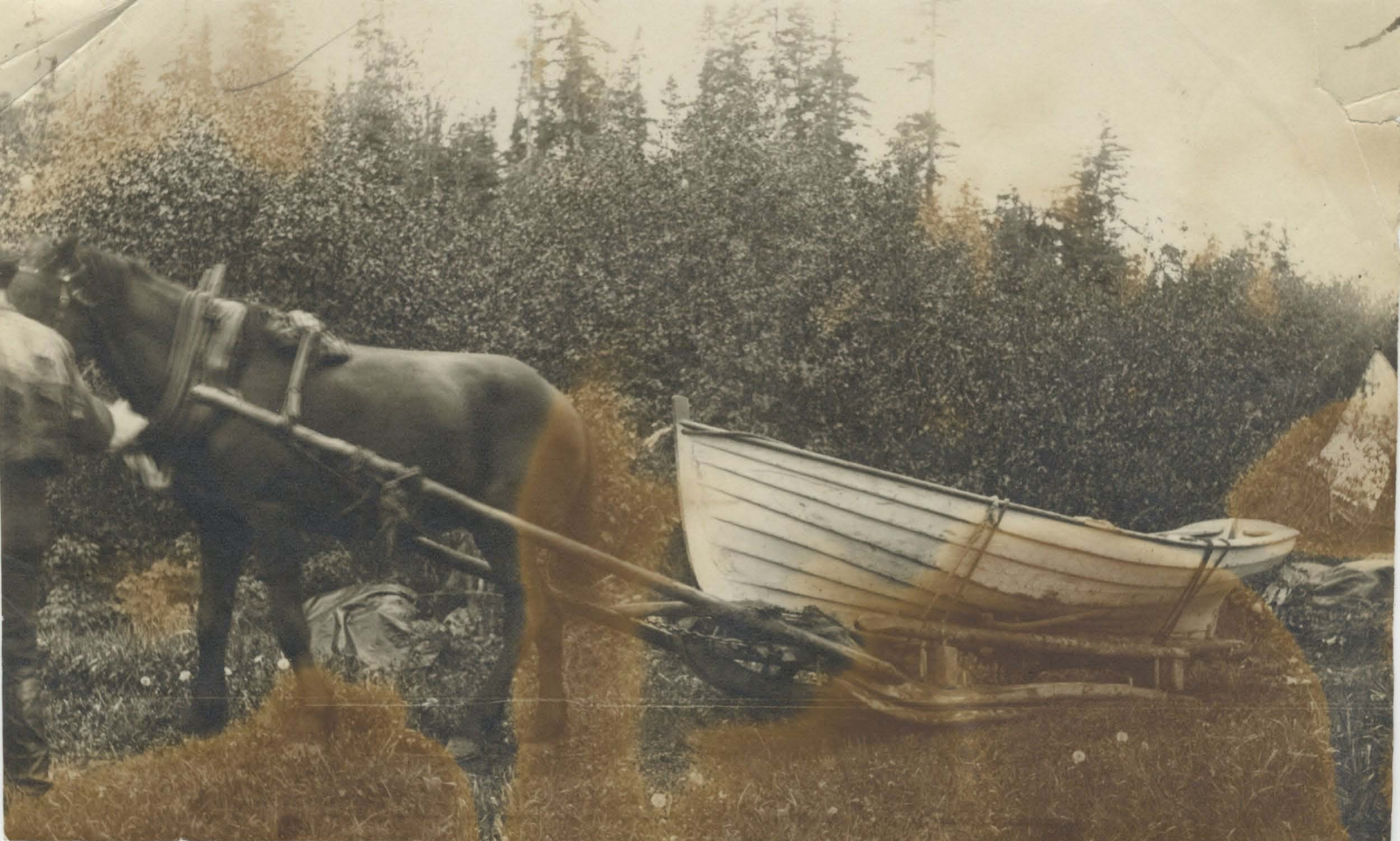
13. [1216] Portaging boat to Grand Lake