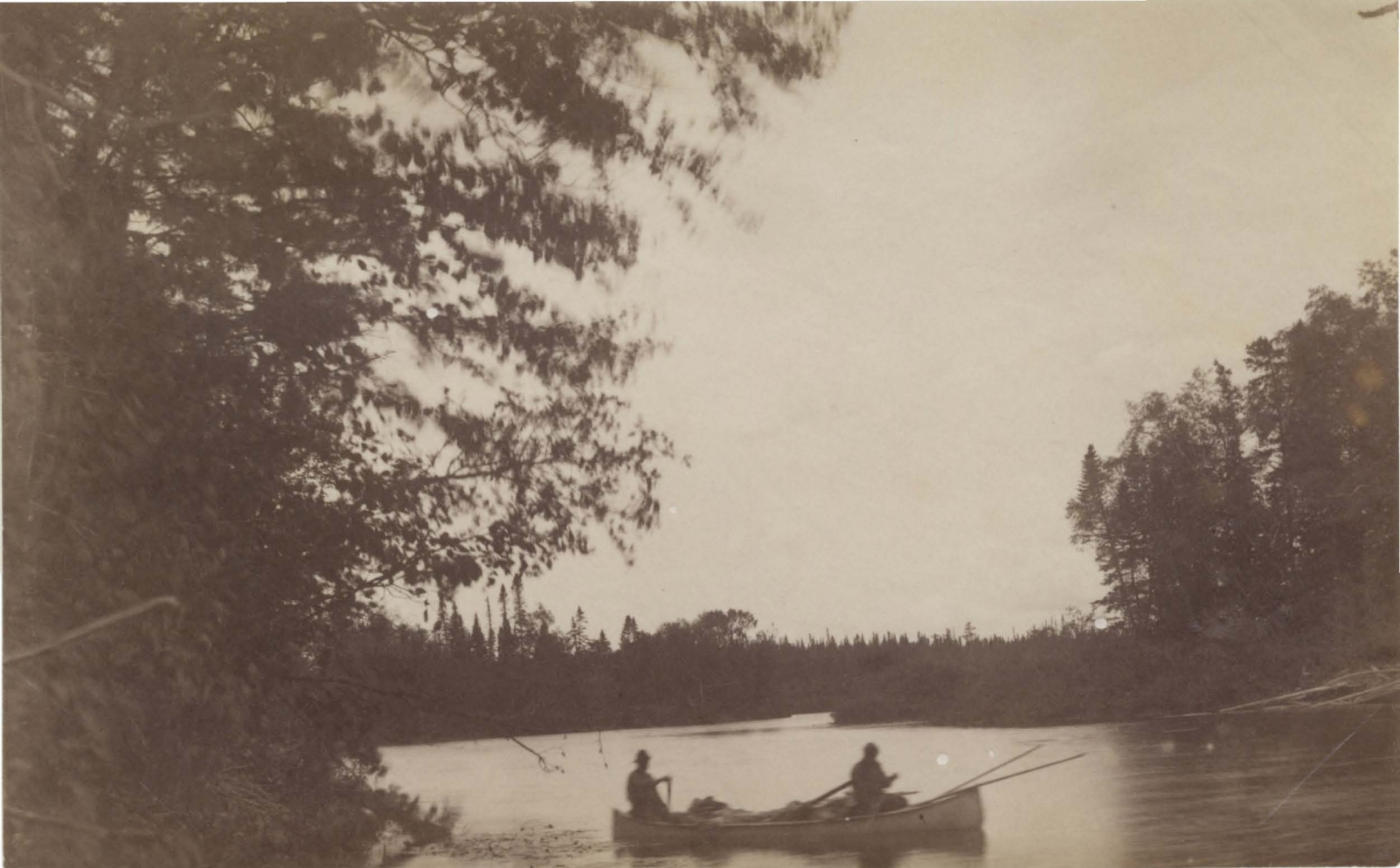
15. [1219] Scene on Willow Steady, Humber River 1891