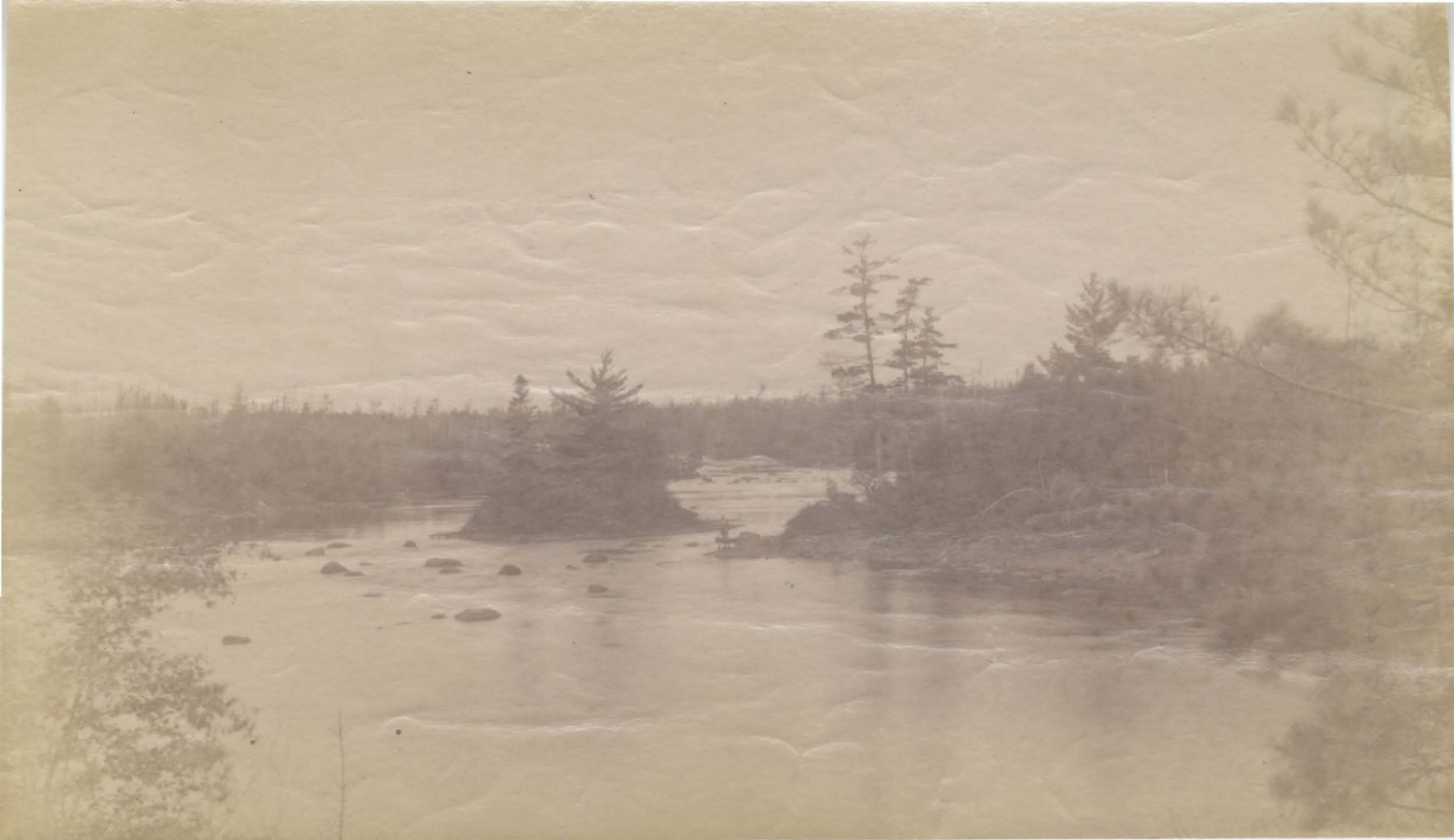
17. [1454] View on N.W. Brook Clode Sound above Chain Bridge