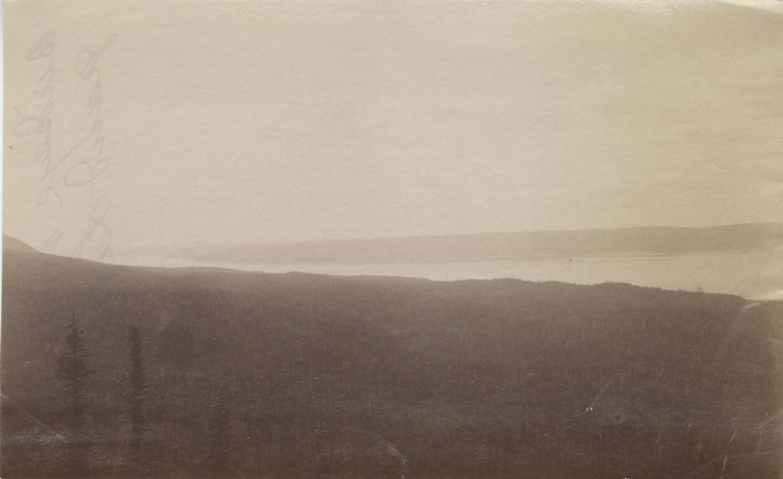
38. Birdseye view of Grand Lake