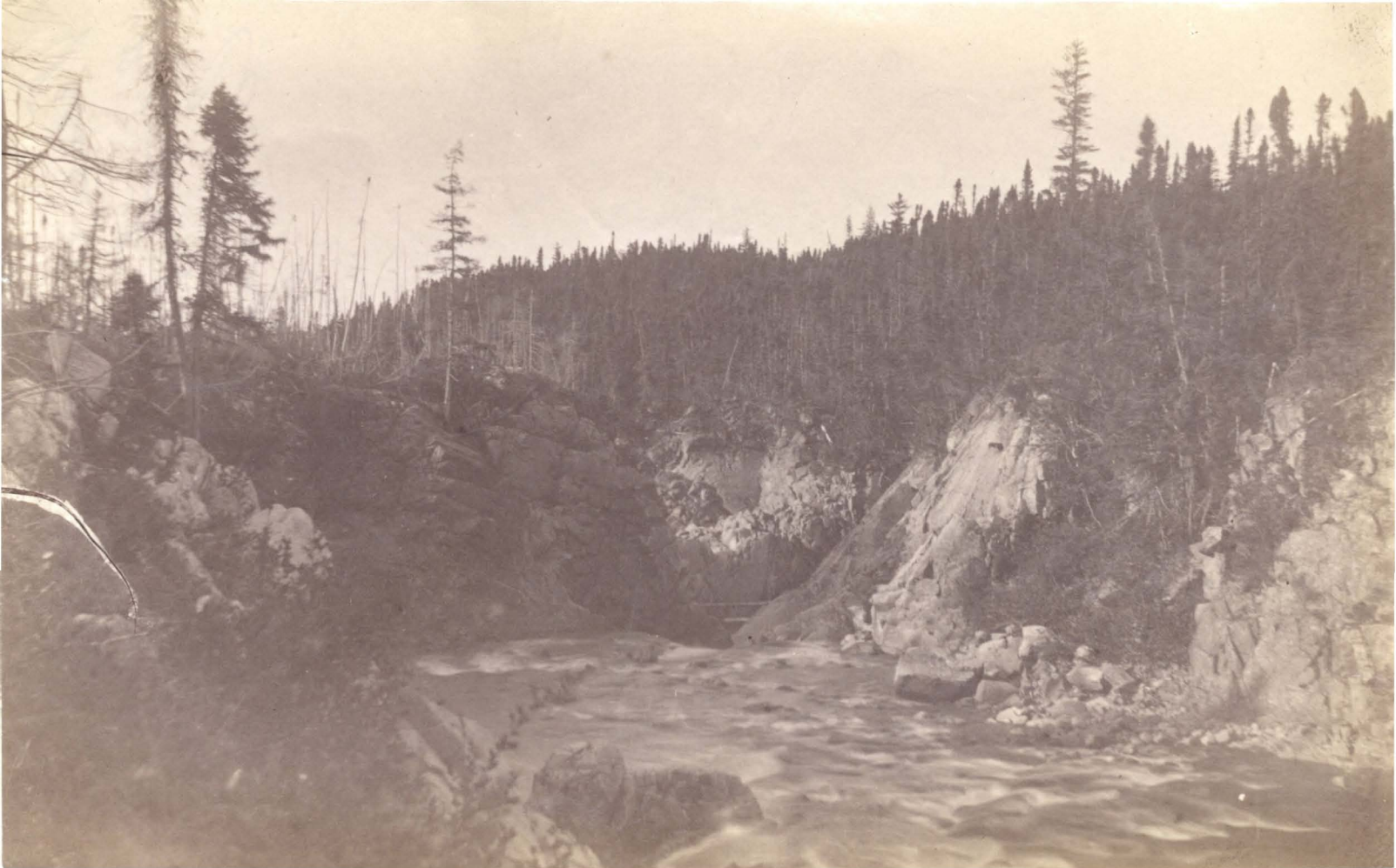
7. View above Kitty's Brook fall, looking down