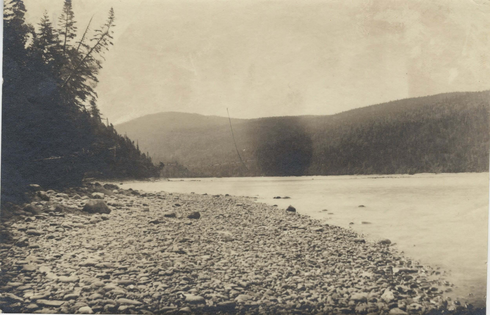
29. Lower end Deer Lake, Humber R