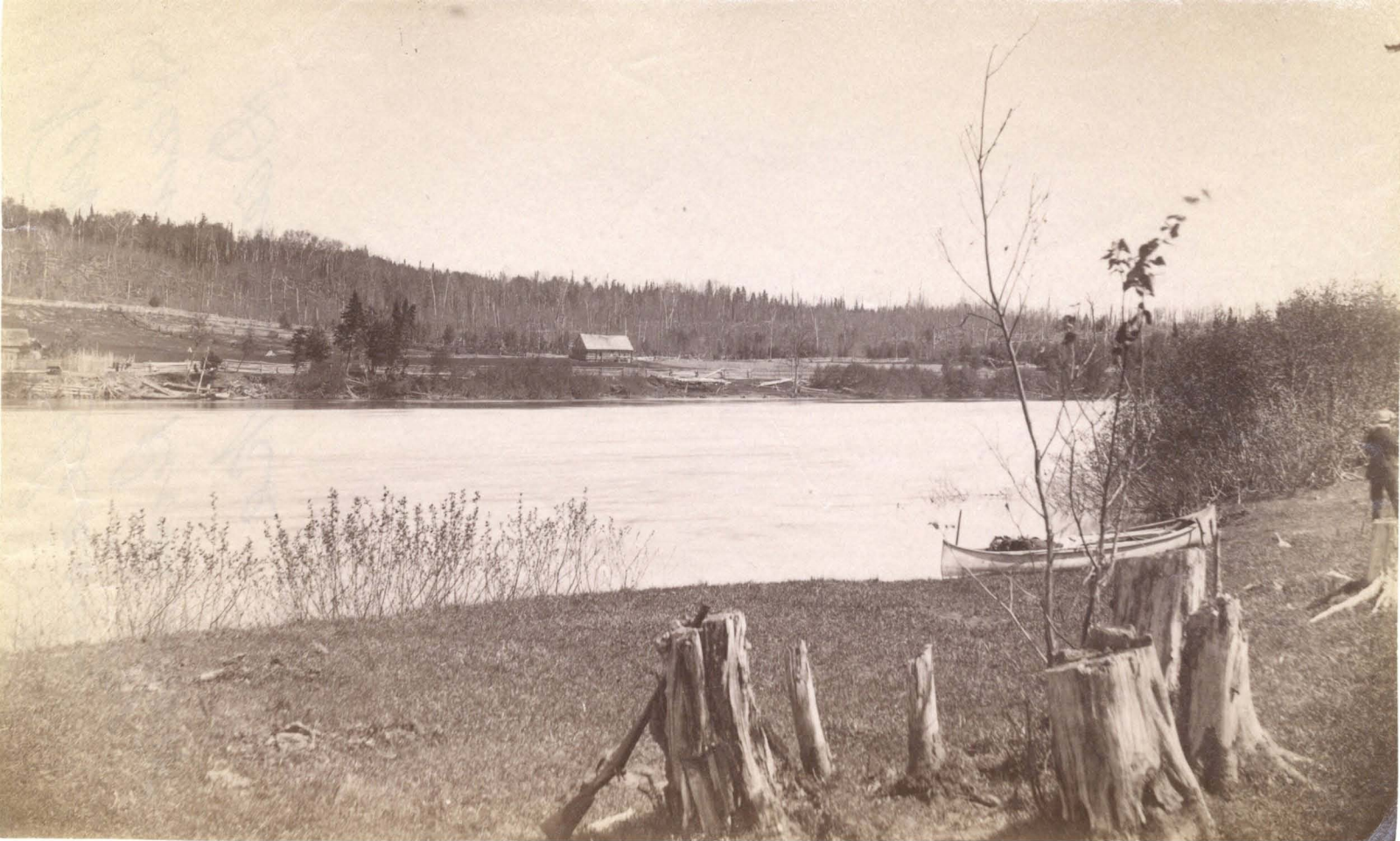
11. [1214] Nicholls' clearing Humber River above Deer Lake