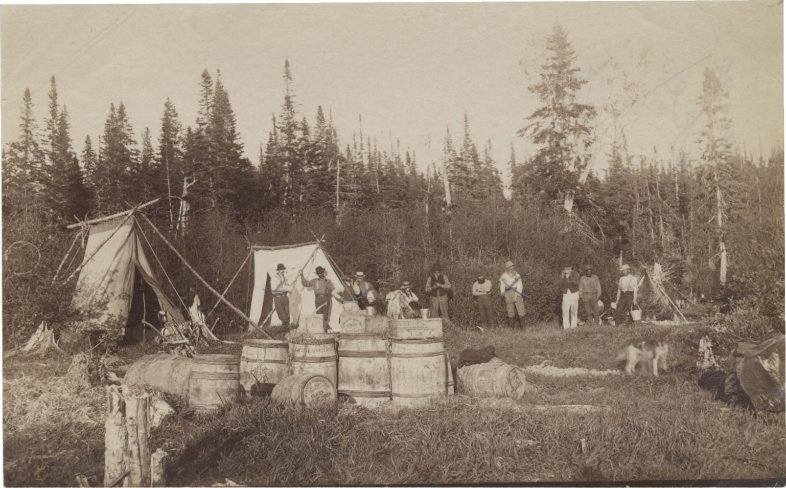
12. [1215] Camp at commencement Grand Lake portage Junction Brook Humber