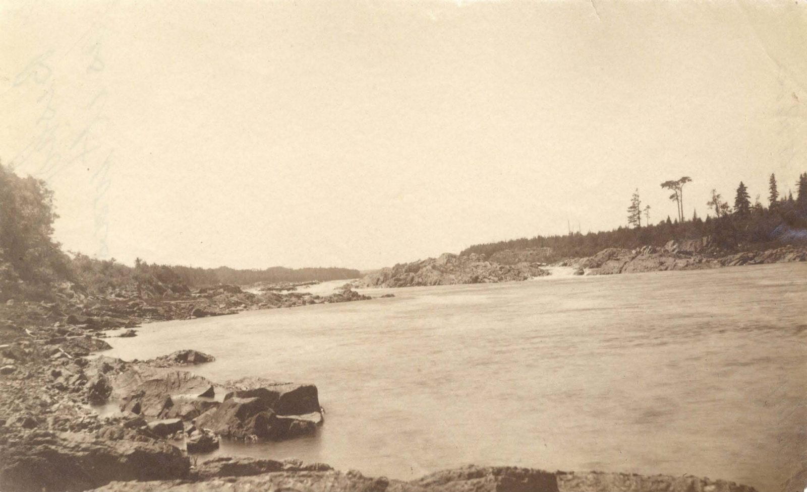
2. Bishops Fall as it was in 1875