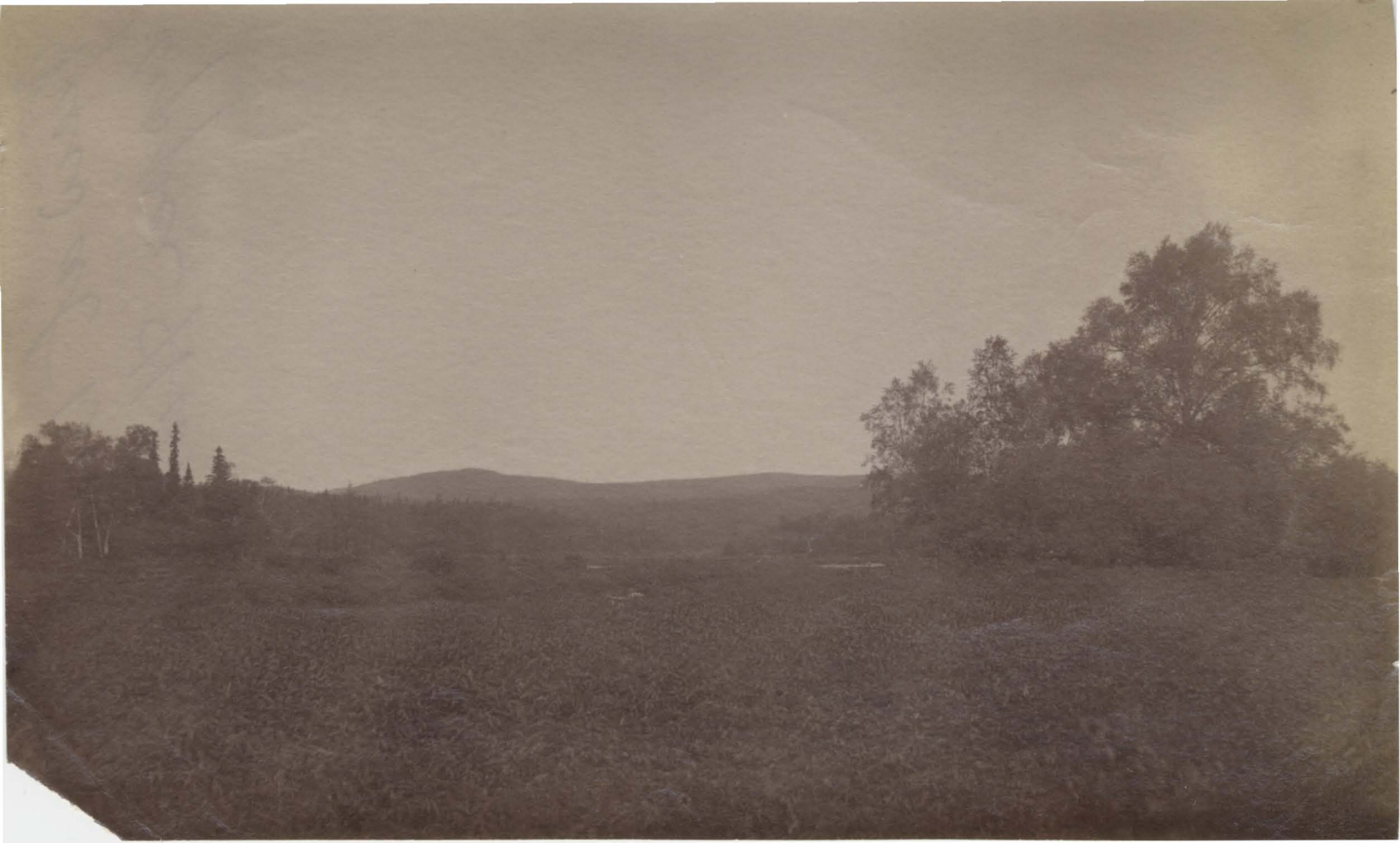
14. View at Birchy Pond upper Humber