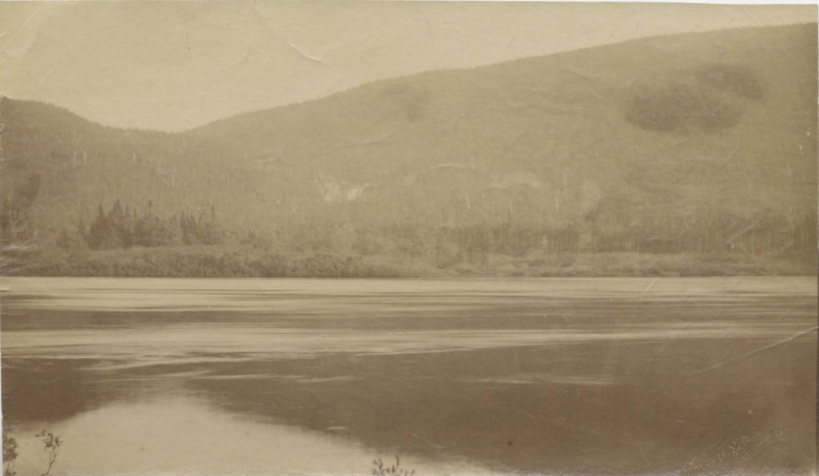
16. View on the Humber River looking across the River. Cascade in distance