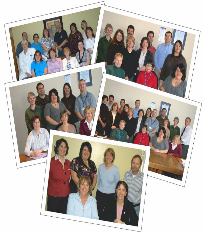
Care and Support Team • PCR Planning Team Assessment and Placement Team • LTC Redevelopment Team Evaluation Team

This case study illustrates how local partners, including community, were effectively engaged in a meaningful research project.