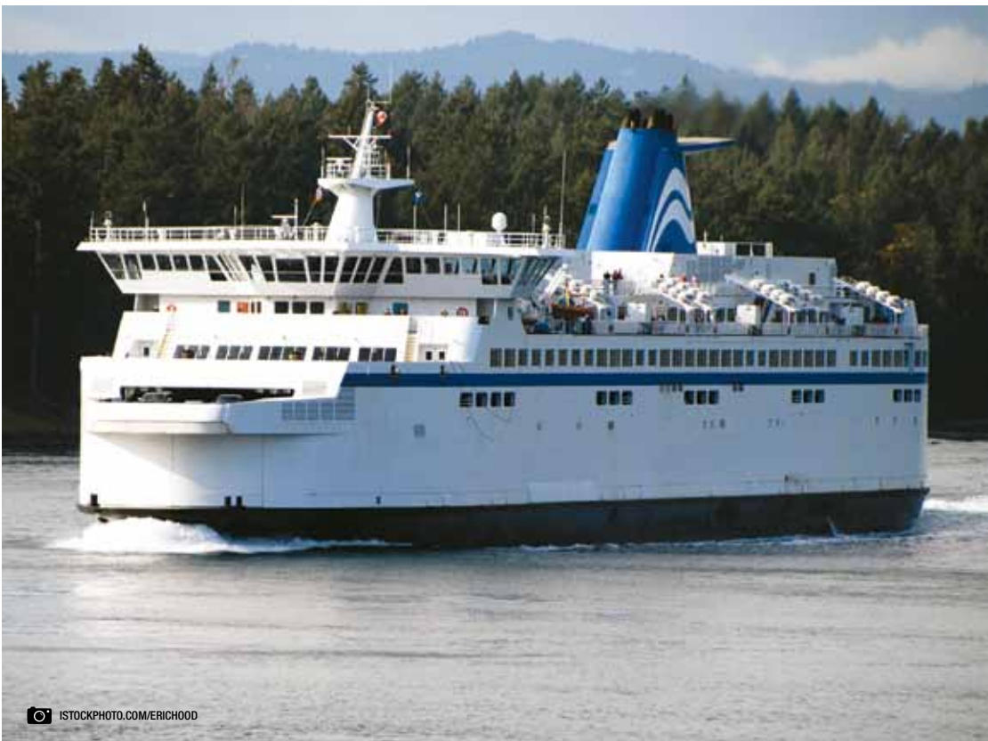
Figure 1: The IMO Maritime Safety Committee Resolution on LRIT applies to passenger vessels, cargo ships, and Mobile Offshore Drilling Units. Here a passenger ferry navigates the waters off Vancouver Island, British Columbia.

Coincident with the adoption of MSC.202(81), the Maritime Safety Committee also adopted Resolution MSC.211(81) prescribing arrangements for the timely establishment of LRIT. This resolution recognized the need for an expedited implementation of LRIT. Contracting governments to the SOLAS convention were asked to advise the Maritime Safety Committee of its plans to establish national and regional LRIT data centres. As well, contracting governments were asked to submit proposals regarding the establishment of an international LRIT Data Centre and Data Exchange. The International LRIT Data Centre was to be operational by July 1, 2008, with national and regional centres to follow by October 1, 2008.