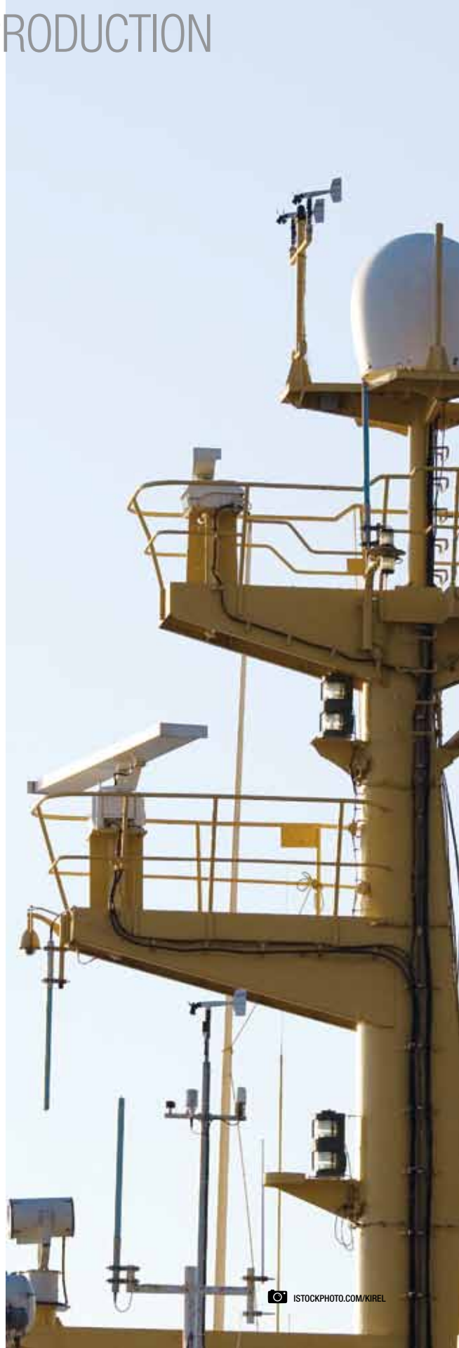
Figure 5: The ISPS Code called for the adoption of Long Range Identification and Tracking (LRIT) as a matter of priority. Here a ship's mast holds communication and location equipment.

Service providers provide the continuity in the network between the vessels and their authorized LRIT data centre, provide transaction management, and ensure that information is stored and routed in a secure accountable manner. To keep reporting costs to an absolute minimum, only a minimal information packet is transmitted from a vessel over the Inmarsat C satellite link. Consequently all that is typically transmitted from the ship is its position, the time and date that the position was provided, and a unique identification number. The service provider, through the course of handling the information, adds value at a number of points. First, the Inmarsat identification number, while unique to a vessel, does not in and of itself identify that vessel. Consequently the service