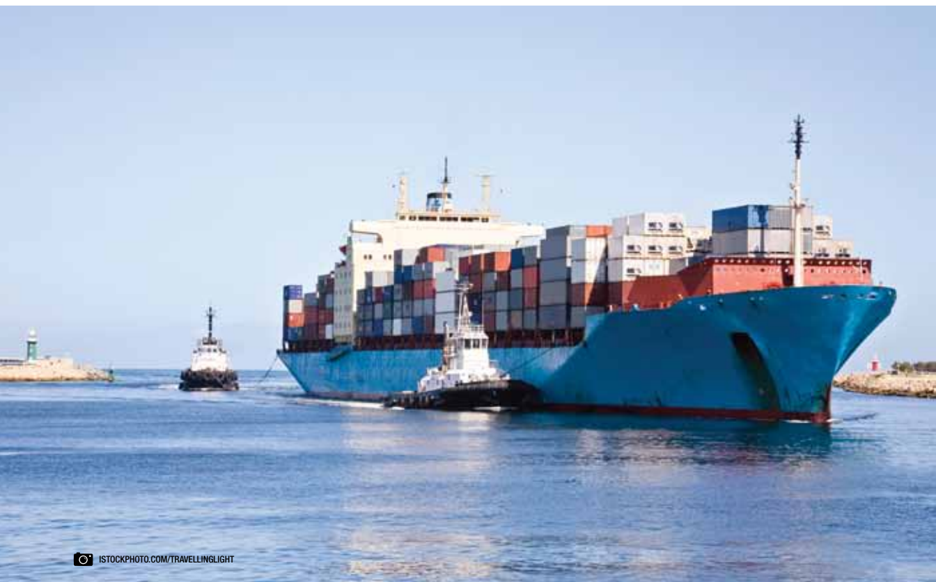
Figure 6: A container ship entering Swan River, Fremantle Port, Western Australia. Care has been taken in the implementation of LRIT to ensure minimal costs for ship owners.

At the initial IMO MSC meeting regarding LRIT in May 2006, the need for a timely and orderly roll-out of LRIT was recognized. To ensure early adoption and reliance on LRIT by the maritime community, a communications medium was required with the reliability and ubiquity to ensure that it would essentially be a risk-free element as the service was established. Consequently, implementation and operation of LRIT to date has relied on the Inmarsat C and Mini C services as the communications medium for reporting LRIT information. However, IMO Resolution MSC.263(84), "Revised Performance Standards and Functional Requirements for the Long Range Identification and Tracking of Ships," does not stipulate specific communications service for the vessel to shore reporting requirements.