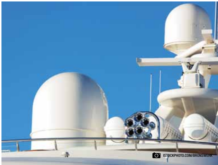
Figure 7: Communication and safety equipment onboard a yacht.

The European Maritime Safety Agency has recently awarded a contract for the development and operation of a European LRIT Data Centre as well as associated ASP and CSP responsibility to the French satellite service provider Collecte Localisation Satellites offering LRIT service over both the Inmarsat and Iridium systems. The result will be a Data Centre serving in excess of 10,000 LRIT compliant vessels representing twenty-seven EU flag states as well as Iceland and Norway.