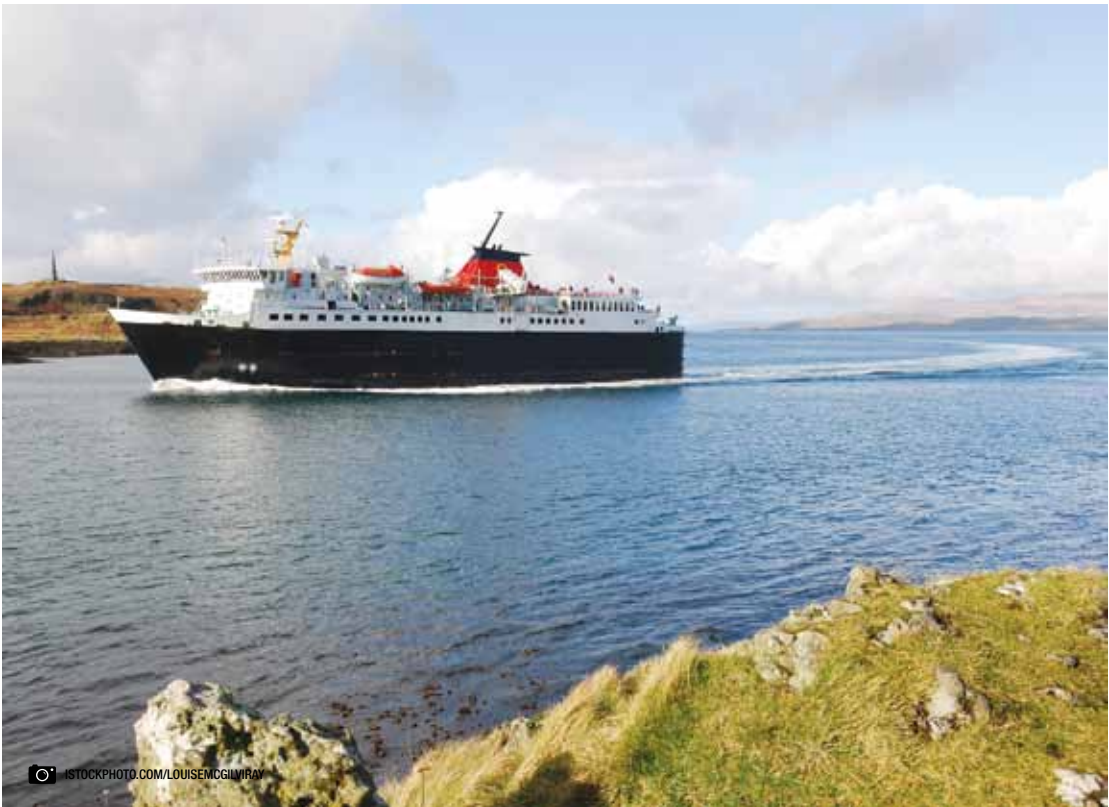
Figure 3: Coastal ferry entering Oban, Scotland.

The overall functionality of the LRIT network is defined by the LRIT distribution plan. The first feature of the distribution plan is a listing of all entities that are entitled to exchange LRIT information. This list includes, of course, the international, regional, and national data centres and additionally includes all contracting governments, search and rescue agencies as well as other LRIT data users such as application service providers (ASPs) and communications service providers (CSPs).