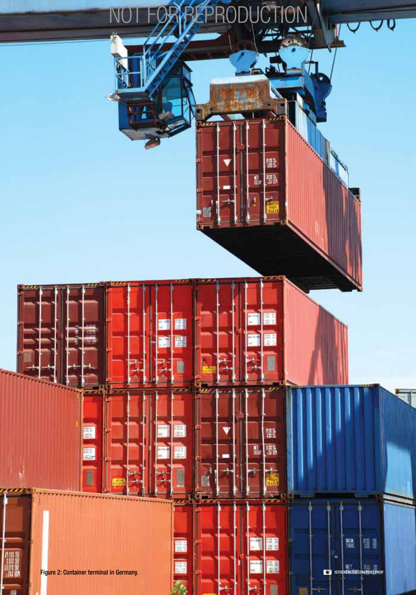
Figure 2: Container terminal in Germany.