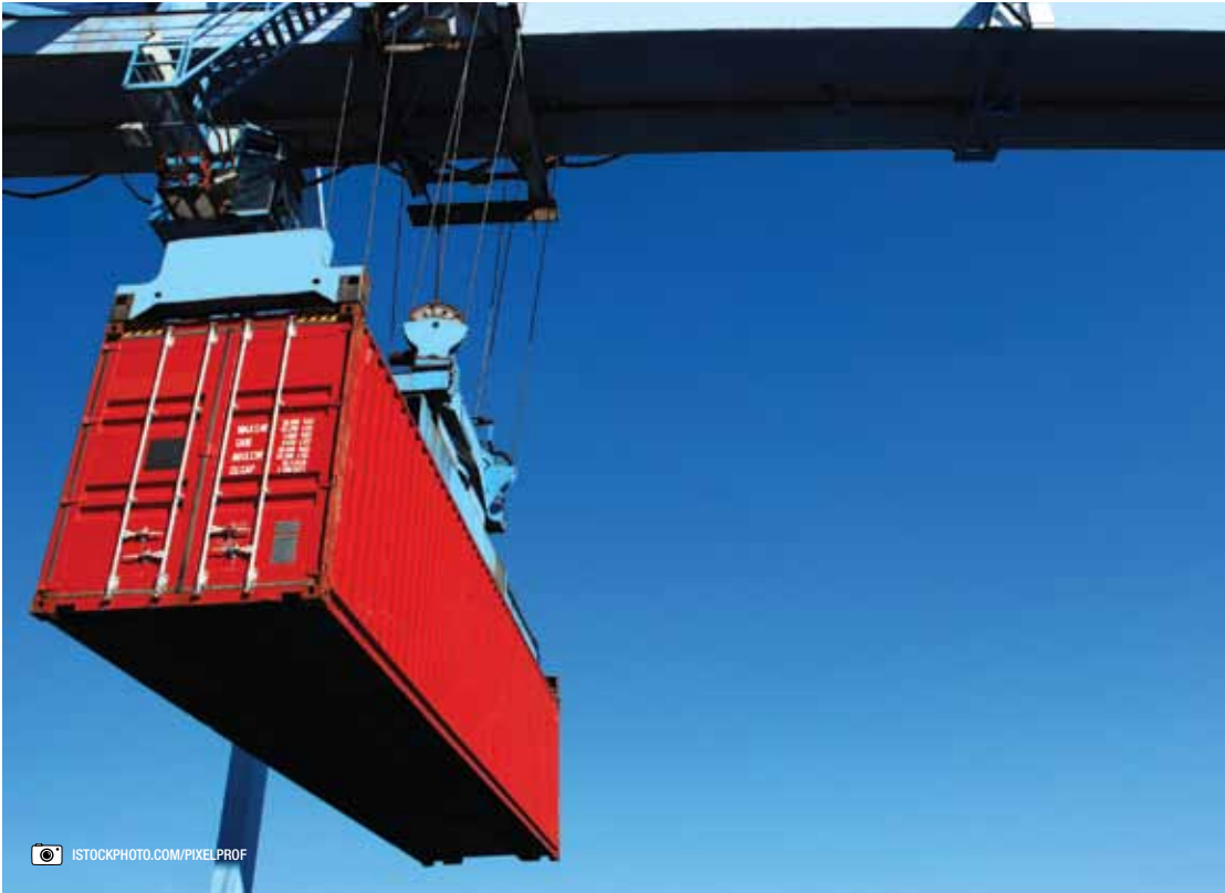
Figure 4: Lifting a container from a stack to a ship.

it is entitled to stop the distribution of LRIT information transmitted from ships that are entitled to fly its flag.