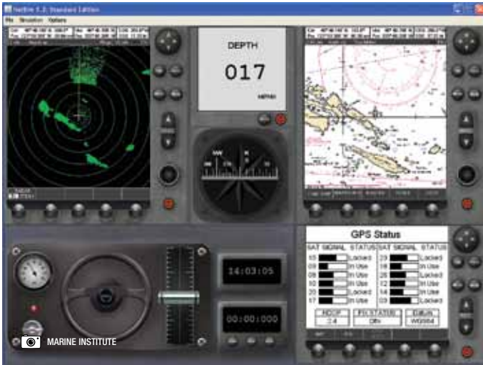
NETSIM provides simulation in radar control, the electronic charting environment, compass reading, depth gauge monitoring, and GPS.

use of a GPS, for example, can be shown how to plot waypoints, routes and courses and then how to use the GPS to select a route and follow it through to the final destination.