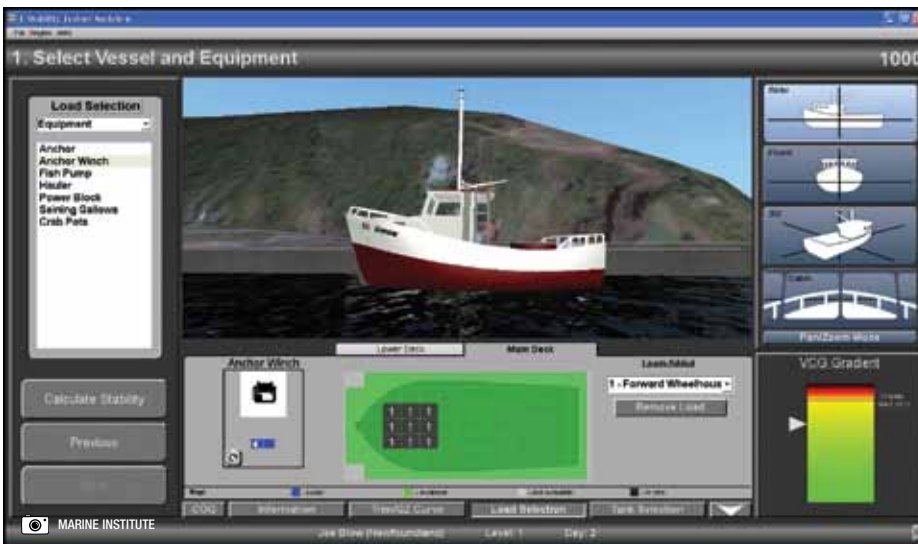
"What-if" scenarios can be manipulated by fishers to determine how vessel management decisions would affect a vessel's stability before the vessel leaves the dock.

the opportunity to further investigate vessel stability concepts by interacting with the 3D simulation engine. Using this hands-on process the student chooses a hull type and size, engine size and location, tank types, size and location, topside design and specific equipment. Fishing gear, fuel, fresh water, ice and consumables are also loaded. The student is then able to assess the vessel's stability characteristics in multiple loading scenarios and how best to manage loading of the vessel in varying sea states. What-if scenarios can be manipulated by the student to determine how vessel management decisions would affect a vessel's theoretical stability before the vessel leaves the dock.