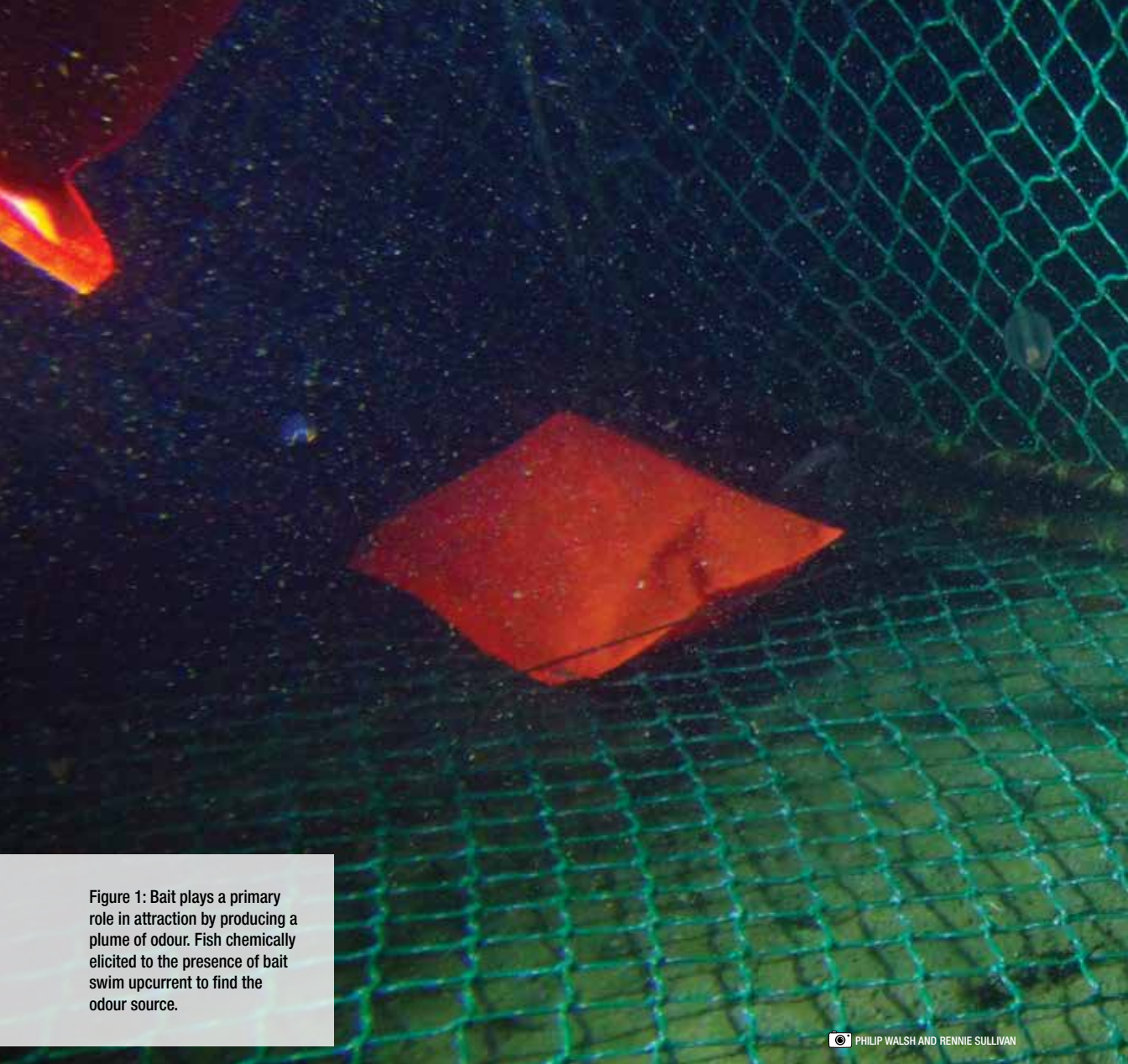
Figure 1: Bait plays a primary role in attraction by producing a plume of odour. Fish chemically elicited to the presence of bait swim upcurrent to find the odour source.