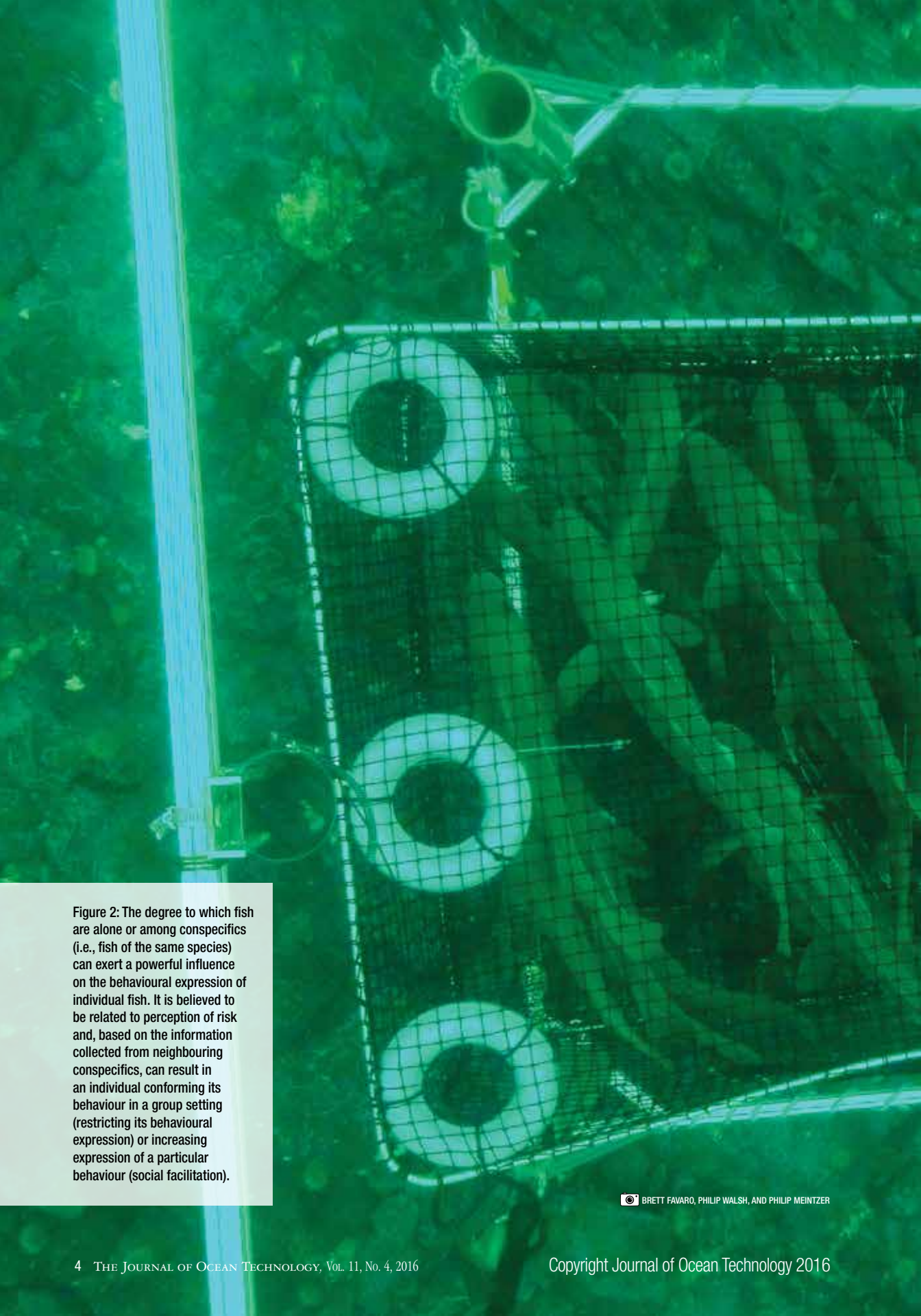
Figure 2: The degree to which fish are alone or among conspecifics (i.e., fish of the same species) can exert a powerful influence on the behavioural expression of individual fish. It is believed to be related to perception of risk and, based on the information collected from neighbouring conspecifics, can result in an individual conforming its behaviour in a group setting (restricting its behavioural expression) or increasing expression of a particular behaviour (social facilitation).