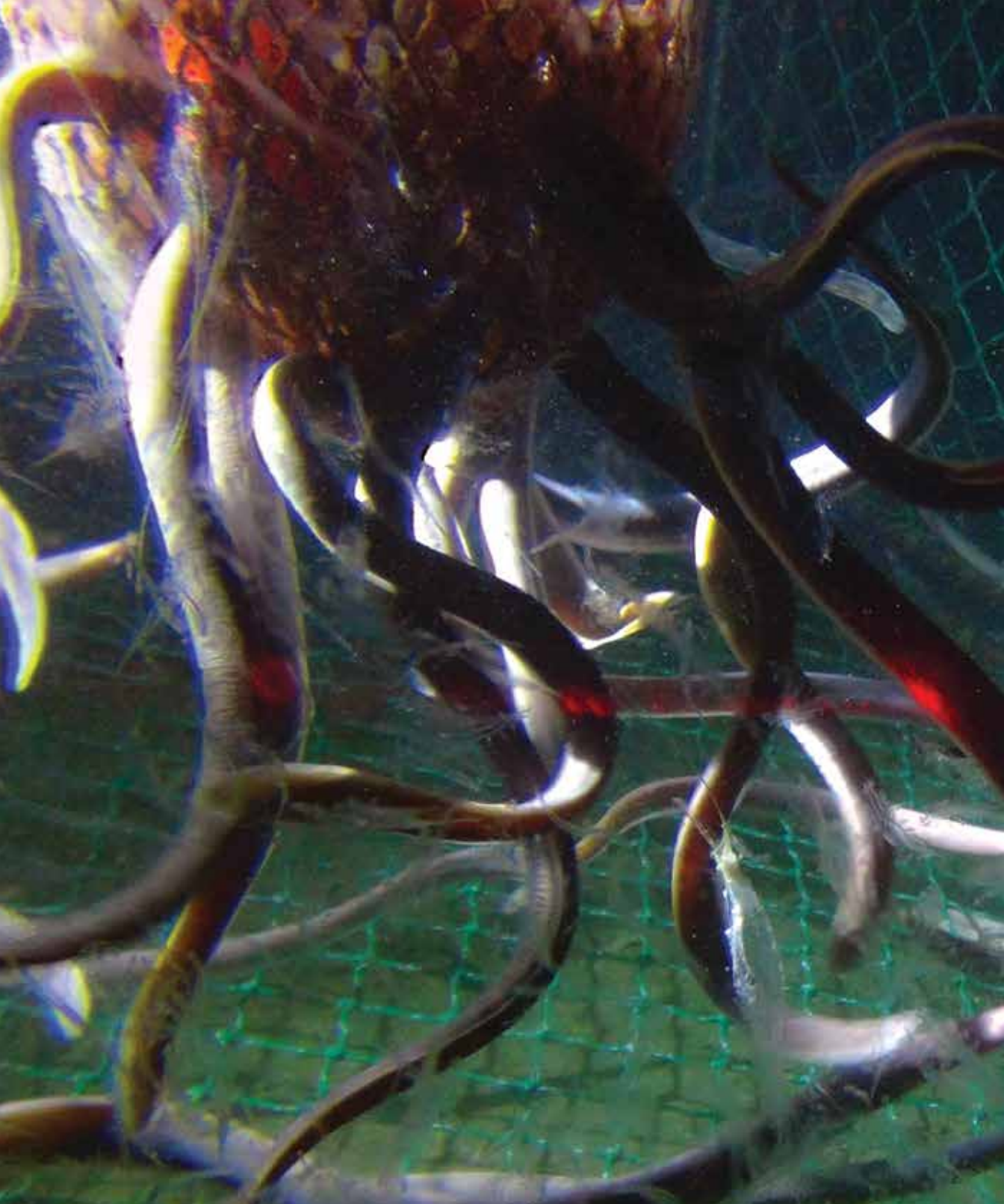
Figure 4: Non-targeted species can create competition for space and resources. Underwater observations have shown that hagfish ( Myxine glutinosa ) commonly compete for bait in fish pots depleting the bait, and altering and weakening the bait plume, and even preying on the target species inside the pot.