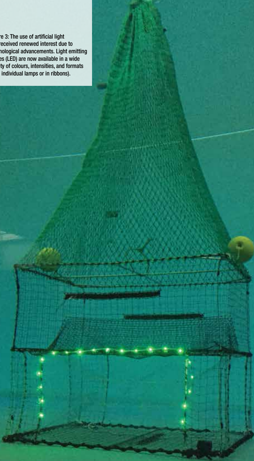
Figure 3: The use of artificial light has received renewed interest due to technological advancements. Light emitting diodes (LED) are now available in a wide variety of colours, intensities, and formats (e.g., individual lamps or in ribbons).