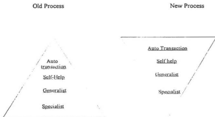
Figure 2 New Web-Based Student Services (Kvavik, 1998)