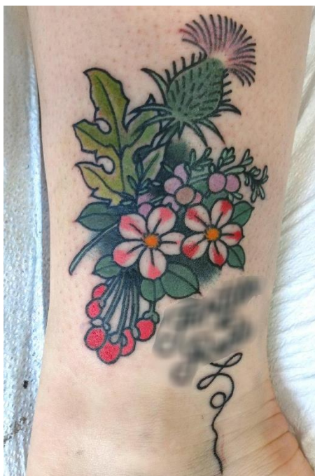
Figure 3-3: Lavender's commemorative tattoo on ankle. The photo was altered slightly to blur the family motto, with the approval of the participant.

Similarly, the sprig of Lavender represents her personal history, as it symbolizes her own name.