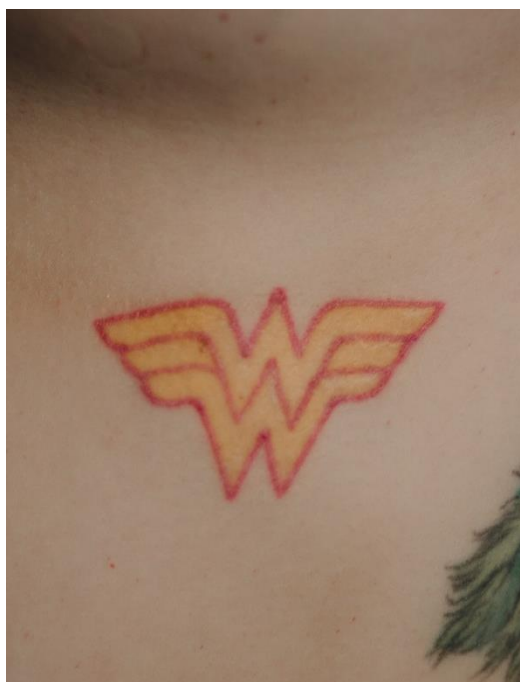
Figure 3-1: Lucy's Wonder Woman symbol, beneath breast.

Within the first year that she was diagnosed, Lucy got the Wonder Woman symbol tattooed under the breast that was removed (Figure 3-1).