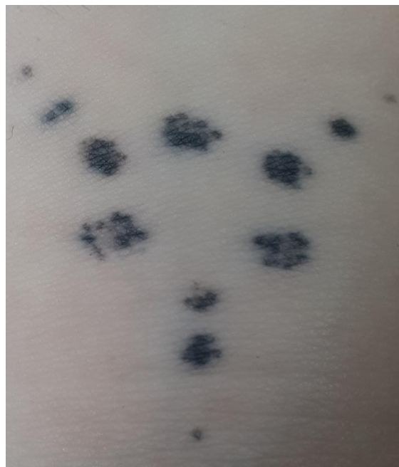
Figure 5-1: Jesse's second stick and poke tattoo on wrist.

Jesse, introduced in Chapter 3, has a stick and poke tattoo that in some ways expresses their queer identity (Figure 5-1).