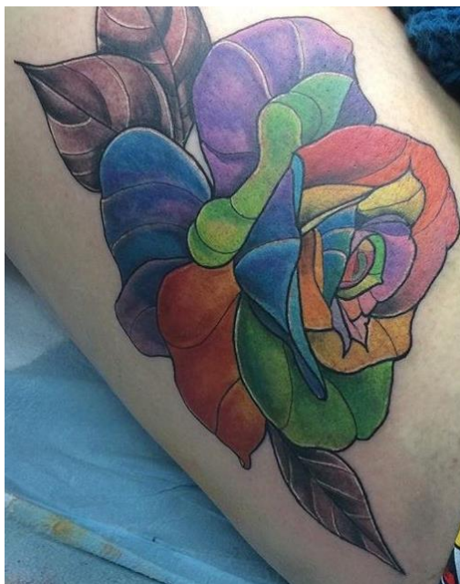
Figure 4-4: Jill’s rainbow rose tattoo on thigh.

were learning about her sexuality and she wanted that represented on her body. Though she got the tattoo while she was in a ‘straight’ relationship with a man, she found it important to express her bisexual identity in a visible way.