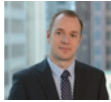
Ryan Brain CMC, MMSc, Deloitte (Toronto) Theme 1: Atlantic Canada in the Global Economy

In July, 2014, Minister Brazil was appointed Minister of Service NL., Minister Responsible for the Workplace Health, Safety and Compensation Commission, Minister Responsible for the Office of the Chief Information Officer, and Minister Responsible for the Government Purchasing Agency. On September 30, 2014, Minister Brazil was appointed Minister of Transportation and Works.